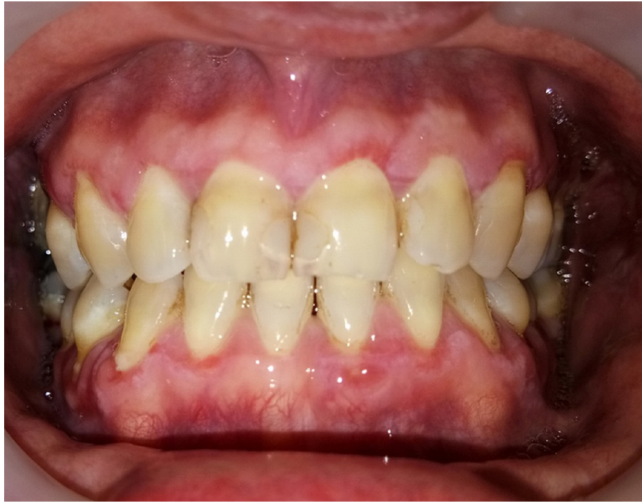
FIGURE 7: Intraoral photograph shows that the generalized gingival overgrowth has resolved following oral hygiene improvement and prophylaxis.

After stopping the cyclosporine therapy, several flare-ups of his OLP were observed. The patient was managed mainly with topical corticosteroids (Dexaltin®), dexamethasone mouthwash, and intermittent short-term oral prednisolone 5 mg daily dose given for two weeks. The patient's OLP lesion is overall moderately controlled with a topical corticosteroid (Dexaltin®). However, the patient responded well to systemic steroids, as the resolution of the lesion is seen after dosages of prednisolone 5 mg for two weeks.