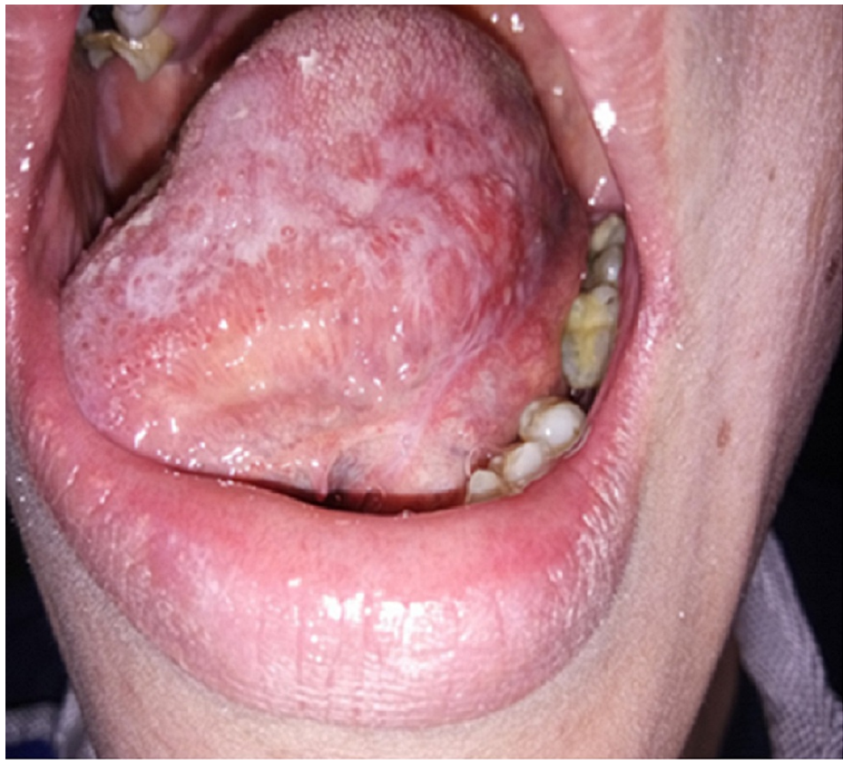
FIGURE 1: Intraoral photograph shows the left lateral border of tongue and dorsum having areas of erythema and white striations on initial presentation.

An incisional biopsy from the left lateral border of the tongue was performed and sent for routine histopathological examination and direct immunofluorescence. Histopathological findings confirmed OLP. Direct immunofluorescence was negative for fibrinogen, complement protein C3, immunoglobulin (Ig) A, IgG, and IgM, excluding any other immunological mucosal disorder. A skin patch test was carried out using the European standard patch test kit (Chemotechnique diagnostics, Vellinge, Sweden) along with dental material screening series. The patient showed no hypersensitivity to any of the tested substances, including the dental materials.