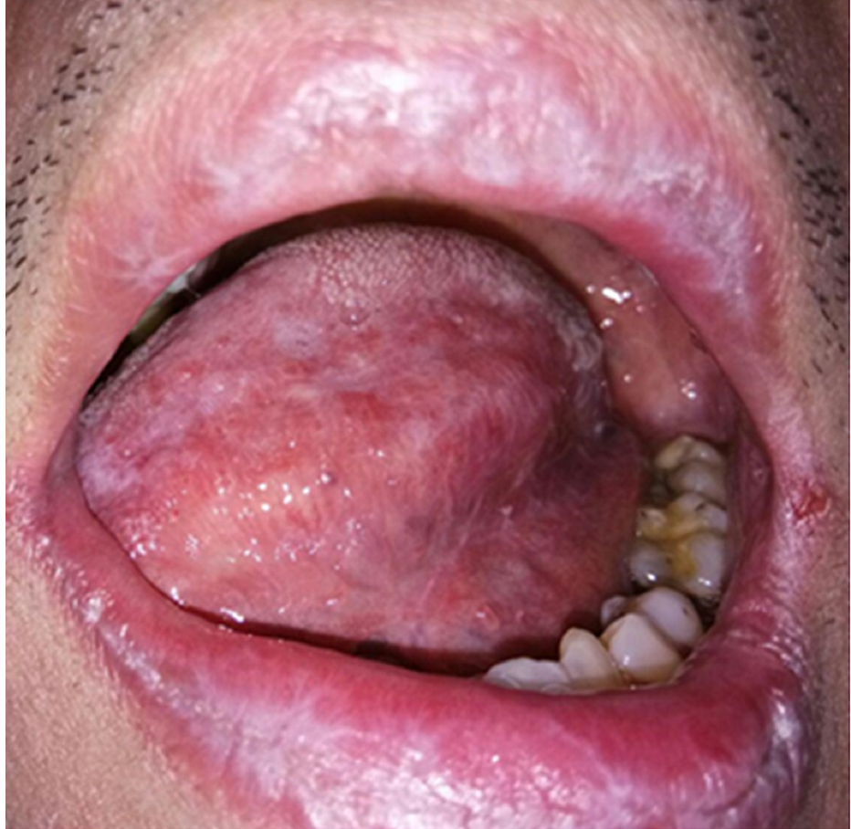
FIGURE 4: Intraoral photograph shows left lateral border of the tongue and dorsum having mild erythema after taking systemic cyclosporine.

the hematology reports, was undertaken. A bone marrow trephine biopsy revealed markedly hypocellular marrow, with 5% cellularity, and the erythroid precursors were markedly reduced. The marrow trephine was interpreted as severely hypocellular marrow, consistent with pure red cell aplasia (PRCA). Thymoma-associated PRCA was established and the patient was treated with systemic cyclosporine 100 mg daily and while on cyclosporine therapy his OLP lesions resolved and became asymptomatic (Figure 4). However, he developed generalized gingival overgrowth which was due to cyclosporine (Figure 5). A diagnosis of drug-induced gingival overgrowth secondary to cyclosporine was established and he received non-surgical periodontal treatment for plaque control.