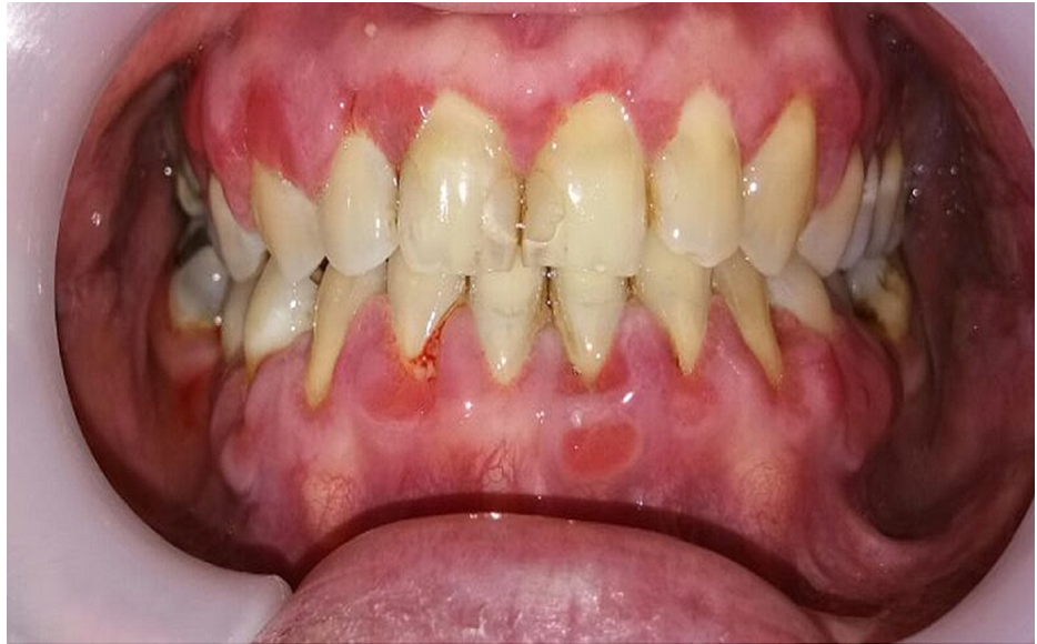
FIGURE 5: Intraoral photograph shows mild generalized gingival growth after taking systemic cyclosporine.

Over three to six months, his cyclosporine dosage was gradually reduced and the gingival overgrowth started to resolve. However, his OLP recurred with white striations, and erythema and ulceration developed on his right and left buccal mucosa, the tongue, and lips (Figure 6).