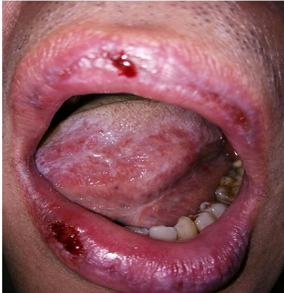
FIGURE 6: Intraoral photograph shows left lateral border of the tongue and dorsum having erythema and ulceration on the upper lip after reducing the dose of systemic cyclosporine.

The patient was further managed with topical steroids and oral hygiene care to control his gingival overgrowth (Figure 7).