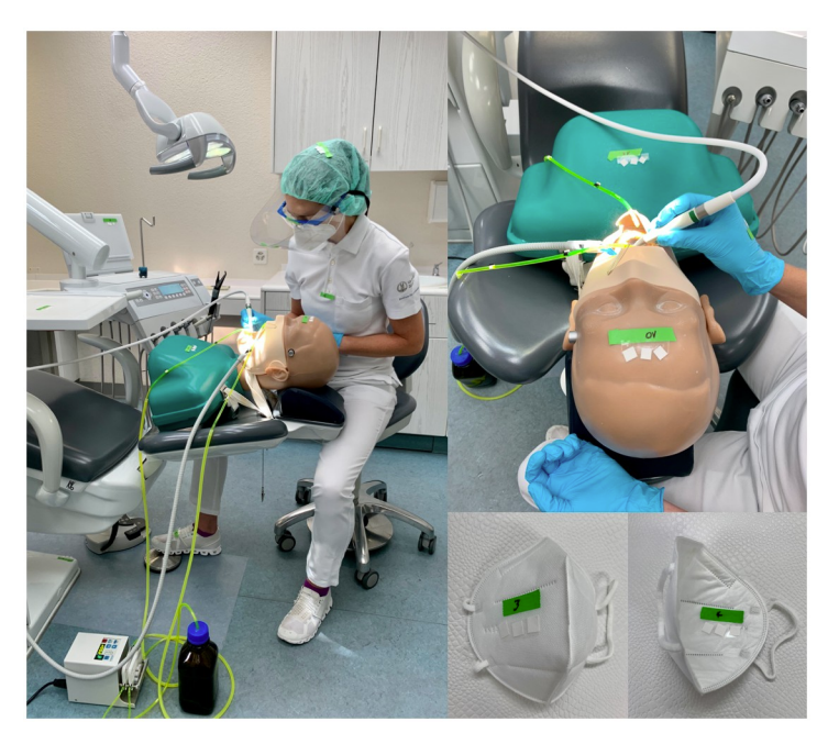
Fig 1. Depiction of the experimental set-up, the dental unit and the exemplified demonstration of adsorbent filters and their fixation via double-sided adhesive tapes.

https://doi.org/10.1371/journal.pone.0244020.g001