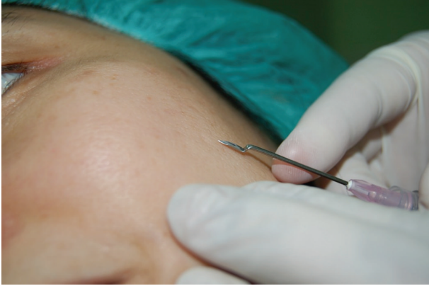
FIGURE 3: The parallel alignment of the needle to the skin surface conforms an ergonomic motion while serving the purpose of the final configuration of the needle, that is, preventing penetration of the skin beyond the scar and maintain a horizontal orientation of the needle tip.

him/her about the direction and orientation. The surgeon can benefit, as well, from the more ergonomic motion for subcising scars with the dominant hand maintained parallel to the skin surface as opposed to moving perpendicular to it, which exerts some stress on the wrist joint (Figure 3). Furthermore, the more ergonomic grip of the cylindrical body of a 3 cc syringe used to hold the bended needle offers an additional advantage to the subcision technique, compared to other awkward physical shapes, an artery forceps, for instance.