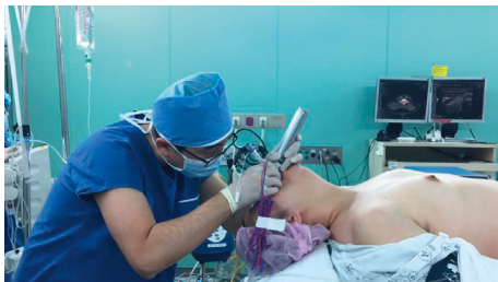
FIGURE 3: Prior to intubation, a pillow was placed beneath the neck for neck extension to avoid tube displacement during patient positioning.