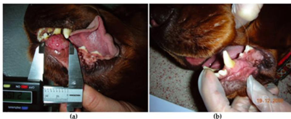
Figure 2. Treatment response of one dog with oral squamous cell carcinoma: (a) immediately prior to treatment; and (b) 21 days after cycle 2 of Paccal Vet treatment. Reproduced from [76].

Another experimental investigation was described by von Euler et al. that demonstrated the better in vivo efficacy of Paccal Vet (100–150 mg/m 2 ) compared with the conventional formulation of paclitaxel (Figure 2) [77].