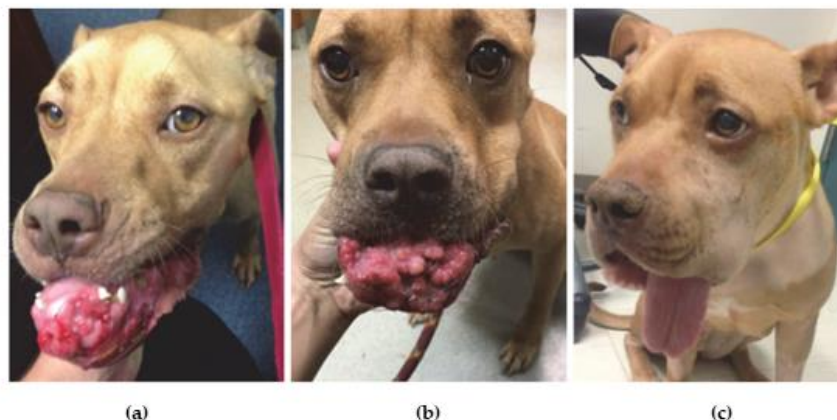
Figure 3. A dog with an inoperable oral squamous cell carcinoma with metastases in regional lymph nodes: (a) before the administration of HylaPlat; (b) after the second injection; (c) at the fourth injection of the formulation. Reproduced by [97].

promoted the localization of cisplatin within the metastatic lymph nodes [98]. The dog reached a complete remission and maintained a stable condition for at least one year after the treatment (Figure 3) [97].