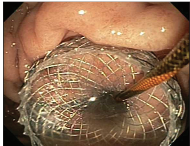
Figure 2. Endoscopic image of LAMS placed via electrocautery enhanced system immediately after deployment