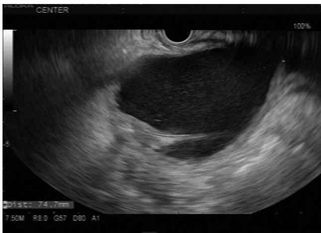
Figure 1. 7.5 MHz EUS image of a pancreatic fluid collection prior to access and drainage

In patients with WON, endoscopic necrosectomy sessions were performed using an upper endoscope advanced through the LAMS at intervals selected by the treating endoscopist, approximately every 3–14 days, until complete debridement of the necrotic cavity was performed as confirmed endoscopically and/or by cross-sectional imaging. Necrosectomy procedures involved a mixture of PFC lavage with diluted hydrogen peroxide mixed with sterile saline, blunt dissection, or necrotic PFC contents using endoscopic catheters, and capture and removal of necrotic tissue by a variety of devices including endoscopic forceps, snares, baskets, and retrieval net devices.