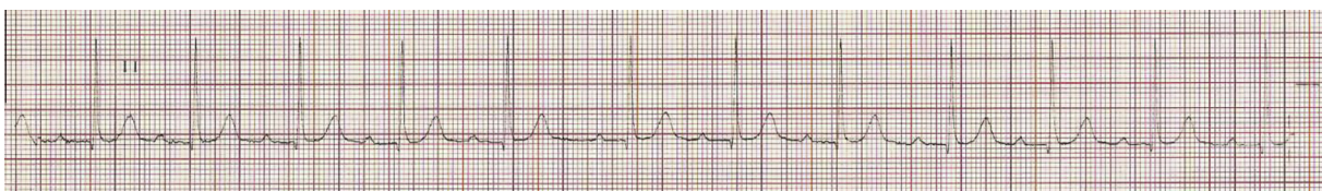
Figure 4. A rhythm strip taken 9 days later showing the return of sinus rhythm, with prolonged PR interval (0.28 seconds).