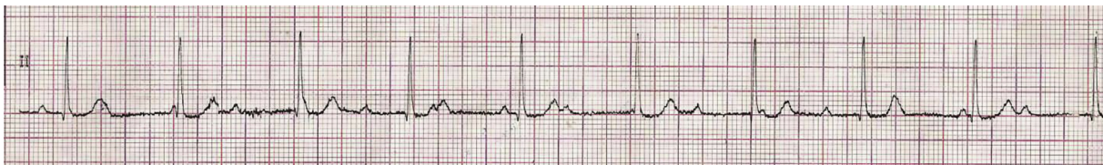
Figure 3. The rhythm strip on presentation showing third degree heart block; the atrial rate is 107/min, the ventricular rate is 63/min.