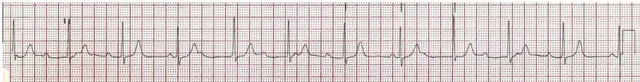
Figure 2. A follow-up electrocardiogram 2 months later, showing third degree heart block; the atrial rate is 115/min, the ventricular rate is 65/min.

Cardiac involvement in acute rheumatic fever is typically described as “pancarditis”, underscoring the fact that the pericardium, myocardium, and endocardium can all be affected. The salient feature, nonetheless, is valvar involvement, given its long term ramifications. It is the hallmark of carditis and is therefore considered a major criterion in the Jones criteria for the diagnosis of rheumatic fever. Atrioventricular conduction abnormalities are also well recognized features of acute rheumatic fever. The advent of ECG has allowed for precise measurement of such abnormalities. Early studies in the 20s and 30s of the last century have found first degree heart block to be a common feature. When Dr Jones introduced his criteria for the diagnosis of rheumatic fever in 1944, he considered first degree heart block as a minor criterion, and that continued in all