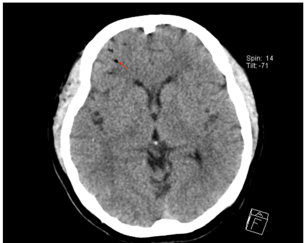
FIGURE 2: Computed tomography (CT) head.

A 71-year-old female with a history of in situ ovarian adenocarcinoma status post appendectomy and right-sided hemicolectomy developed generalized tonic-clonic seizure activity. An initial seizure was noted while undergoing an endobronchial biopsy procedure for evaluation of a perihilar mass. Pathology was consistent with a benign reactive lymph node. During the procedure, she developed mottled discoloration of her skin, spreading from her abdomen to both shoulders. Bag ventilation was started, and she was transferred to the surgical intensive care unit (ICU) and intubated. CT head revealed multiple air emboli (Figure 2).