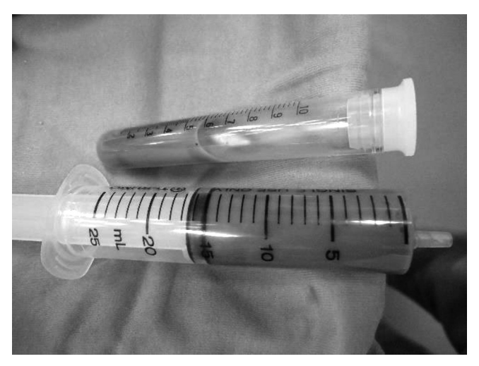
Figure 2 Hematoma with pus evacuated from the left subdural space.

The patient experienced abdominal pain 23 days after admission and was diagnosed with CBDS. A gastroenter-ologist in our hospital performed endoscopic retrograde cholangiopancreatography. Simultaneously, bile was collected and cultured. However, E. tarda was not detected.