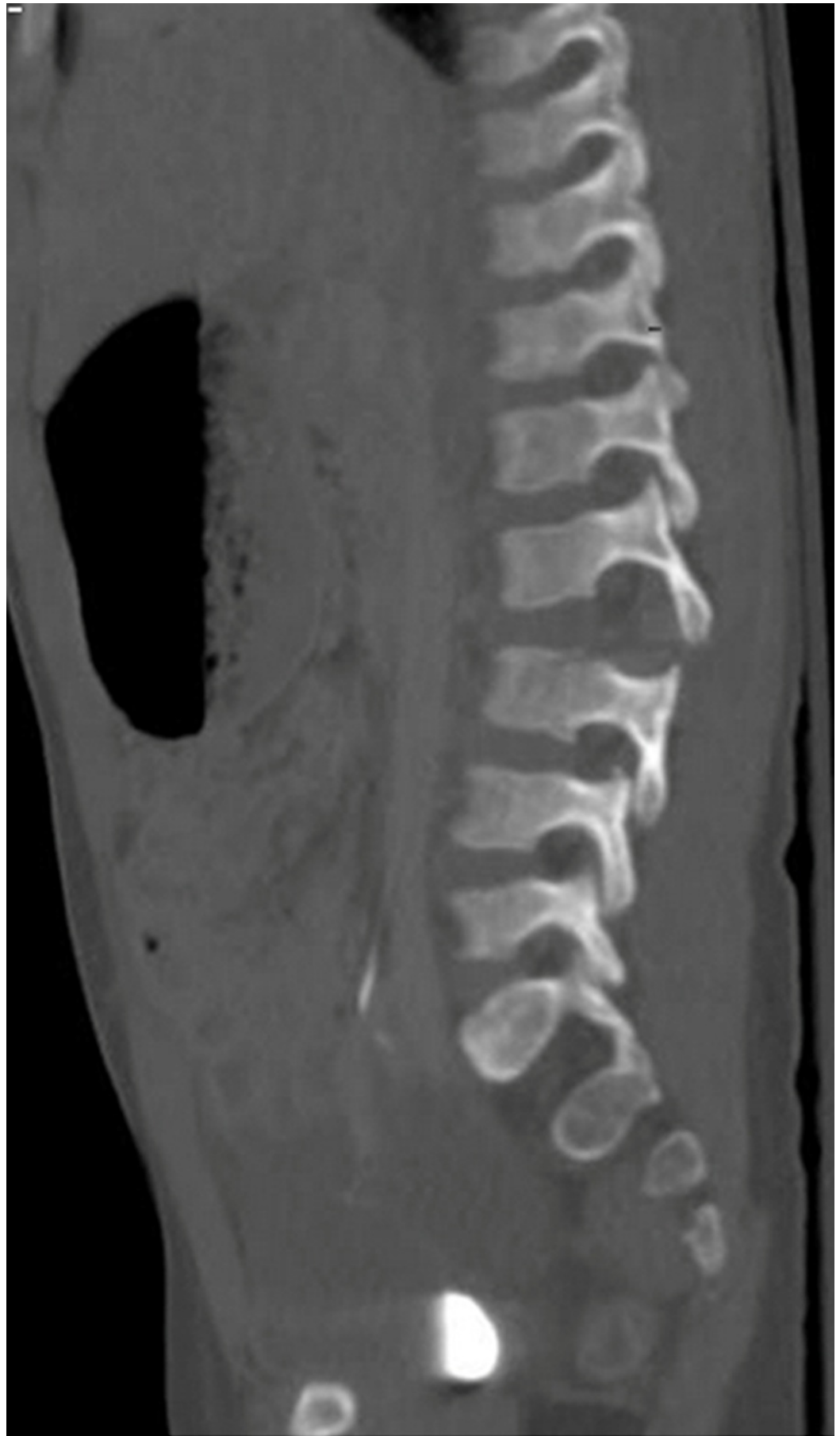
FIGURE 1: Sagittal CT scan with contrast of the lumbar spine