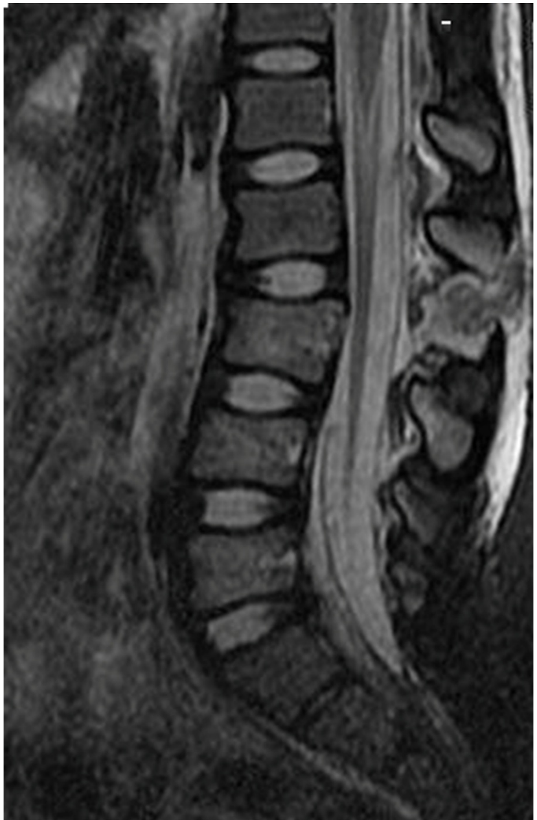
FIGURE 3: T2 weighted MRI of the lumbar spine without contrast revealing a hyperflexion injury with rupture of the interspinous ligaments and ligamentum flavum at the L2-L3. The increased signal intensity is consistent with the formation of a hematoma sac.