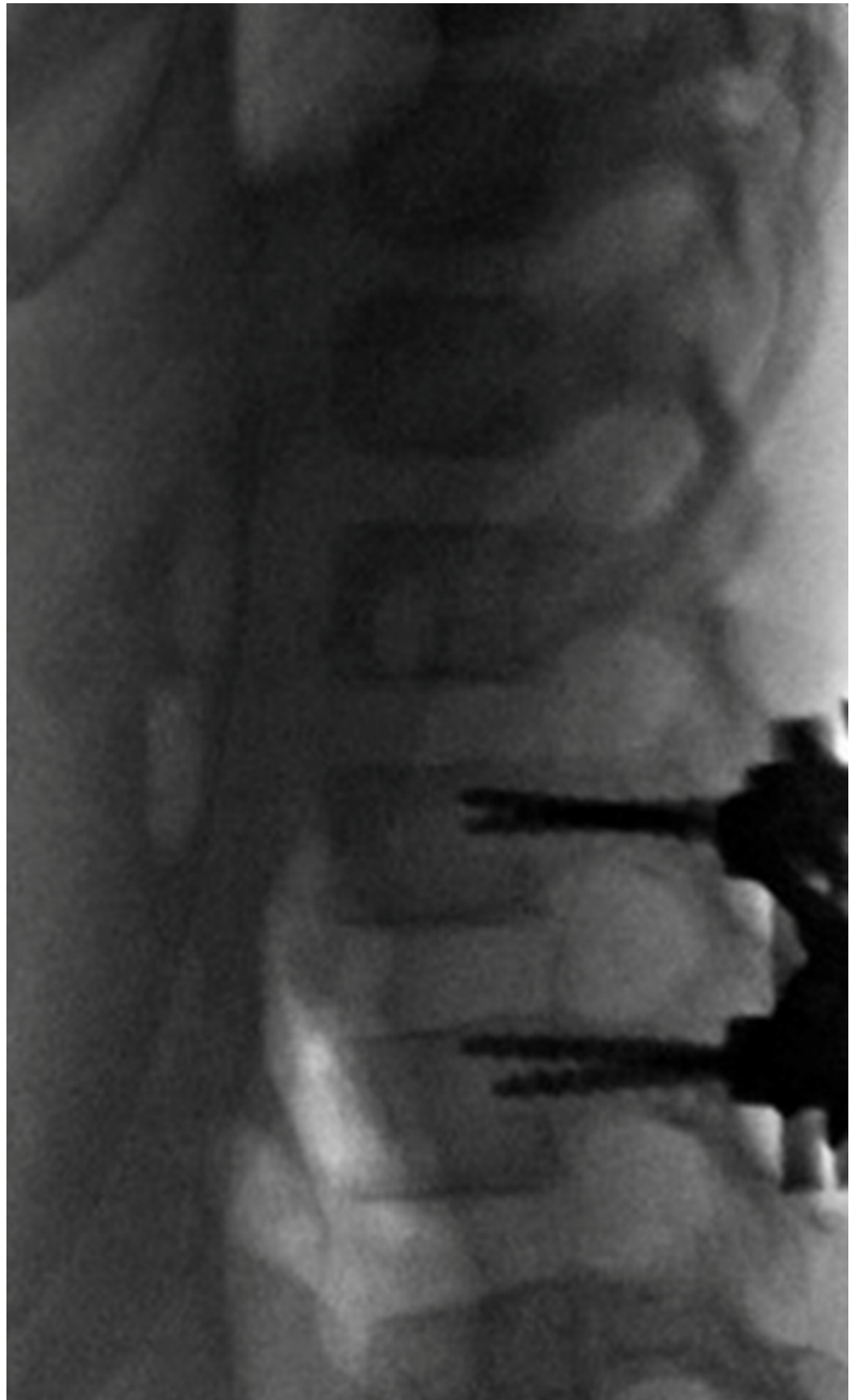
FIGURE 5: Intraoperative X-ray showing internal fixation and reduction of the facet joint at L2-L3.