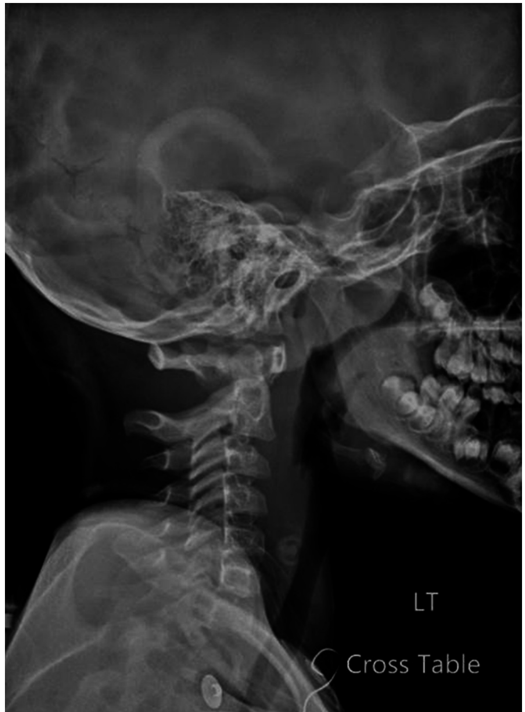
FIGURE 2: Lateral X-ray of the cervical spine revealing mild anterolisthesis of C2 on C3.

right of midline. There is angulation at the L2-3 level with widening of the posterior intervertebral disc space and the spinous processes, findings consistent with ligamentous injury. Fracture was not detected in this series.