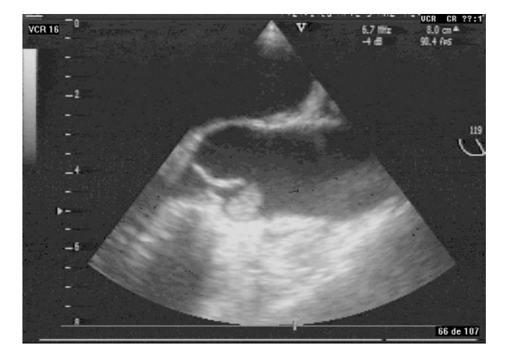
Figure 1 Transthoracic echocardiogram showing a thrombus in the right coronary sinus of Valsalva.