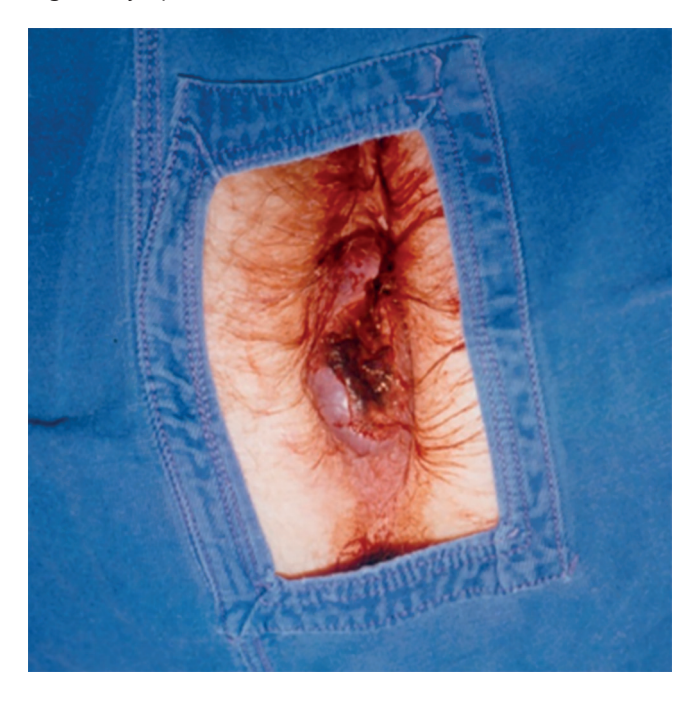
FIGURE 1 - Circunferencial anal lesion in all anorectal canal

Paulo, Brazil, for surgical treatment of the colon lesion and clinical treatment of the anal canal lesion (Figure 1), as he refused to operate the anal lesion. Abdominal ultrasonography and thorax tomography did not reveal any findings. Surgery was then performed with right ileocecal colectomy, intraoperatory biopsy of lesion in the anal canal and of the right inguinal lymph node.