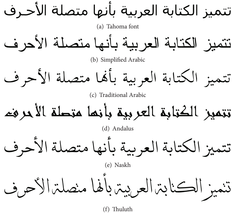
FIGURE 4: Samples from the six fonts in the corpus.

Vertical and horizontal overlaps between cells increase the amount of features generated from an individual line image though increase the processing time. Figure 5 illustrates the outputs of the proposed algorithm and [7] from a small portion of a text line binary image. The proposed algorithm produces 6 feature vectors, one from each column. Khorsheed [7] first slid a 3 \times 3 window vertically with zero overlap which generated three cells. Those three cells were combined together to form one feature vector. The sliding window then shifted two pixels to the left which resulted in one pixel horizontal overlap. The algorithm finally produced only two feature vectors from the given binary image portion. The difference in the size of the feature vectors extracted using the two algorithms will impact training the recognition engine as we shall see next section. Both algorithms implemented VQ to map continuous density vectors to discrete simple symbols. A vector quantizer depends on a so-called codebook which defines a set of clusters each of which is represented by the mean value of all feature vectors belonging to that cluster. Each incoming feature vector is then matched with each cluster and assigned the index corresponding to the cluster which has the minimum difference value or in another words is closest.