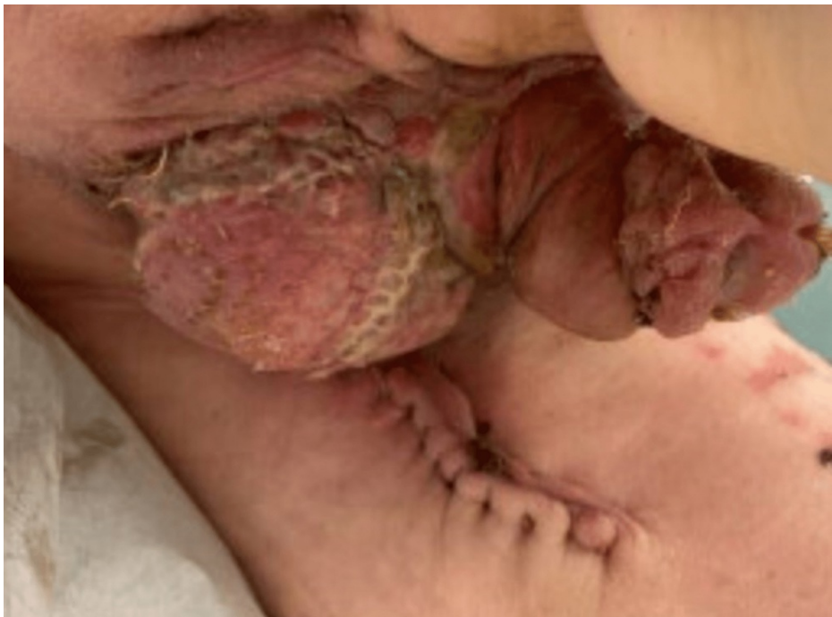
FIGURE 3: The affected area after repair with split-thickness autograft.