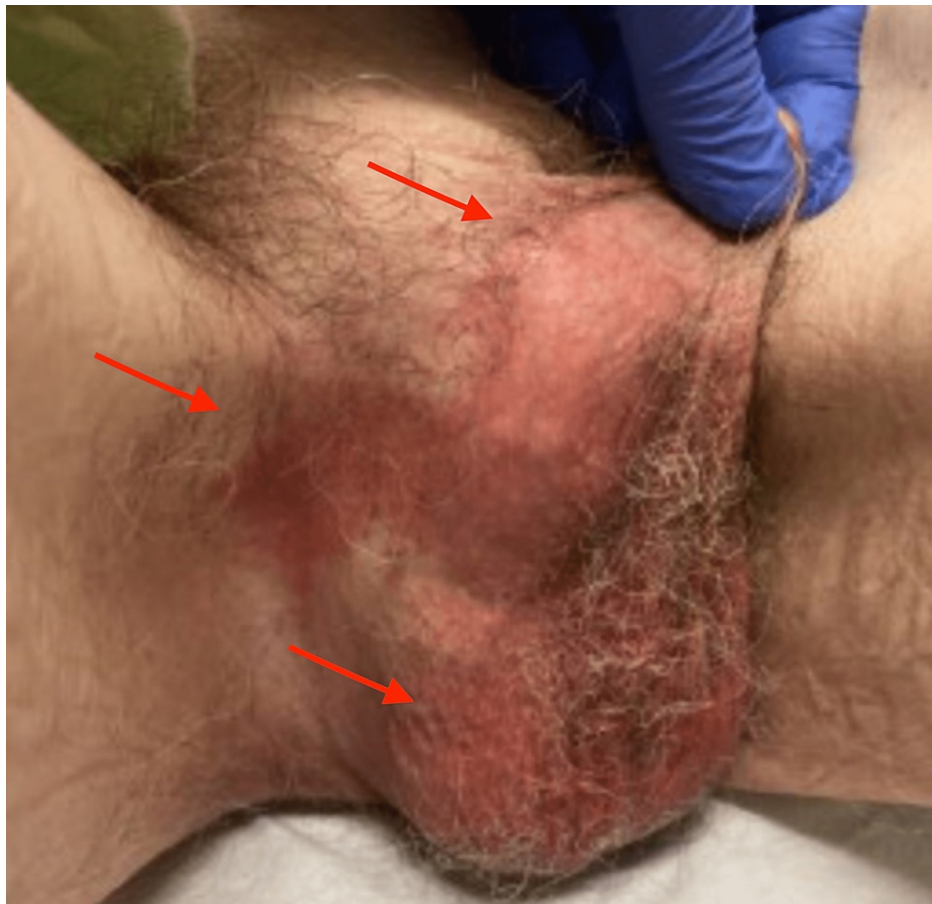
FIGURE 1: The rash at the time of biopsy exhibiting erythema and extension from scrotum towards the penis and inguinal region.

Due to clinical suspicion of malignancy, a punch biopsy of the scrotum was obtained. Histopathological examination of the biopsy sample showed clusters of large cells with pale, vacuolated cytoplasm just above the basal layer of the epidermis (Figure 2). The tumor cells showed atypia, however, there was no invasion into the dermis. Immunohistochemically, the intraepidermal neoplastic cells were positive for GATA3 and cytokeratin 7 and negative for S100 and all other markers including prostate-specific and sensitive marker Nkx3.1. The morphological feature in addition to the immunohistological findings was diagnostic of EMPD. Mohs micrographic surgery (MMS) was performed by urology with extensions of sectioning until negative margins were obtained. Due to an extensive area of defect, including the entire scrotum, about 50% of the perineum from the left to the right thigh crease, one-third of the penile shaft at the base and 5 x 5 cm of the left thigh, a split-thickness autograft was used to reconstruct the area (Figure 3). The postoperative plan for the patient was to apply topical over-the-counter Eucerin cream twice daily to donor and recipient sites. The patient was instructed to follow-up with his urologist and primary care physician in three months to monitor for any recurring signs of the malignancy or sooner if there are any signs of complications, such as bleeding, itching, fever, redness, or discoloration of graft skin.