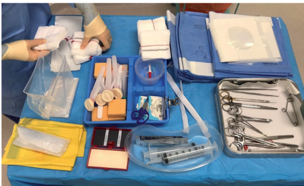
Figure 1: Extracorporeal membrane oxygenator insertion trolley setup.