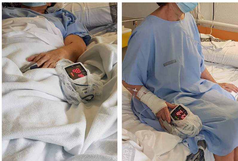
Figure 1. The difference in saturation in sedation from decubitus and the increase in heart rate can be observed.

no reports have appeared in the literature to date that relate POS with the anatomical and functional alterations associated with severe COVID-19 pneumonia.