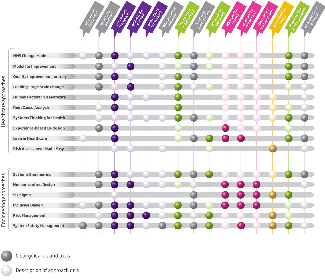
Figure 2 The ability of both engineering and traditional approaches to healthcare improvement to answer the key questions of a systems approach.

techniques it has developed provide powerful insights into the planning and implementation of interventions to complex systems, and incorporating these into a wider systems approach may be of enormous benefit to clinicians and academics seeking to address global health challenges.