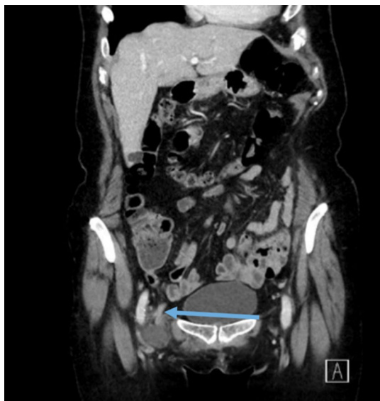
Fig. 1 The Blue arrow shows the appendix going into the femoral hernia on the CT

A 70-year old woman presented at the emergency department with a week's history of painful swelling in the right groin. She had no symptoms of bowel obstruction and no fever. The CRP and white blood cell counts (WBC) were 1.1 mg/L and 5.2 \times 10^9/L , respectively (normal). Physical examination revealed a soft abdomen with painful swelling in the groin and a right-sided para-median incision, which she thought was due to some form of hernia operation, 25 years previously. The preliminary diagnosis was swollen lymph nodes, but an incarcerated femoral hernia could not be excluded. Computed tomography (CT) was performed and revealed a femoral hernia with an incarcerated appendix with fluid around the tip of the appendix (Fig. 1). The hernia could not be reduced and the patient went to surgery. A low midline incision confirmed the diagnosis of de Garengeot's hernia (Fig. 2). As it was not possible to reduce the appendix from the hernia sac, a groin incision was performed. During the attempts to reduce the hernia, the appendix ruptured and it was extracted in pieces. Mesh repair was not chosen as the hernia was obviously contaminated; therefore, suture-repair was with prolene. The postoperative care was uneventful and the patient was discharged the next day. In the pathological examination of the appendix, there were signs of