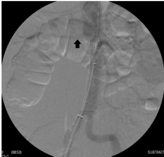
Fig. 3 Intraoperative angiogram demonstrates the aortic stent graft appropriately deployed below the renal arteries (arrow showing right renal artery) to the level of the aortic bifurcation.