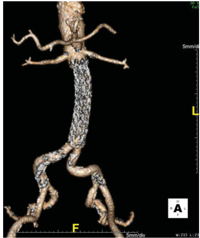
Fig. 5 Computed tomography angiography at 37-day follow-up revealed no active extravasation or endoleak. The hematoma was reduced by 2 cm compared with the previous computed tomography.

Graft dilatation of ePTFE tube grafts can be anticipated up to 20% of their initial diameter, after a mean implantation time of 6 years. 1 It has yet to be defined whether graft dilatation grows until reaching a “plateau” or continues to gradually increase until a critical point of expansion, followed by graft rupture. 1 In our case, we did not notice any