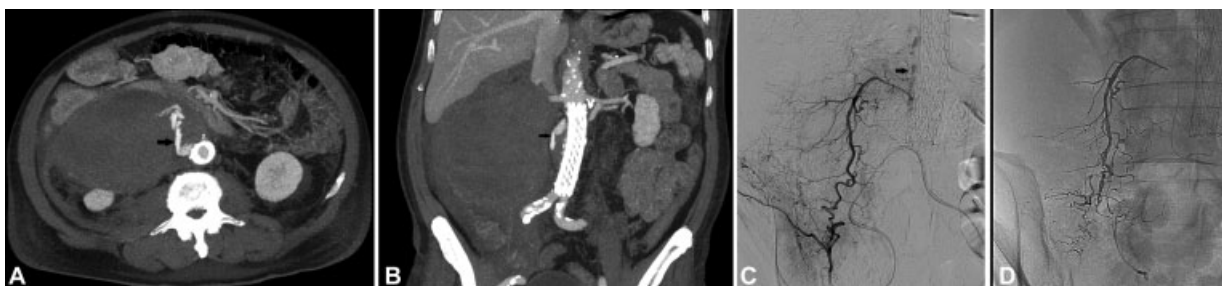
Fig. 4 (A and B) Axial and coronal delayed computed tomography images show right-sided active extravasation (arrow) and extensive hematoma. (C and D) Superselective angiography identified the right iliolumbar artery feeding the site of extravasation (arrow), which was successfully embolized with liquid Onyx (microcoils at the top right side were additionally placed inside a higher level lumbar branch that was originally presumed to be a feeder as well).

Our patient underwent a minimally invasive endovascular procedure instead of an open surgery. Therefore, no histologic evaluation could be performed to assess the internal structure of the prosthetic material, as well as the mechanism of the rupture. The diagnosis of the graft rupture was