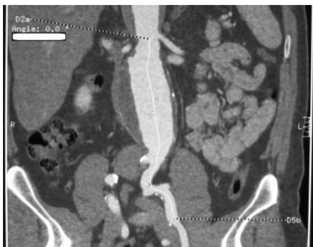
Fig. 1 Computed tomography angiography indicates the 1 cm in length reverse taper infrarenal neck of the abdominal aortic aneurysm. No excessive calcium was shown.

times a day, metoprolol 12.5-mg twice a day, dabigatran 150-mg twice a day, irbesartan/hydrochlorothiazide 150/12.5-mg once a day, thiamazole 15-mg twice a day, alfuzosin 10-mg once a day, metformin 1,000-mg once a day, and omeprazole 20-mg once a day.