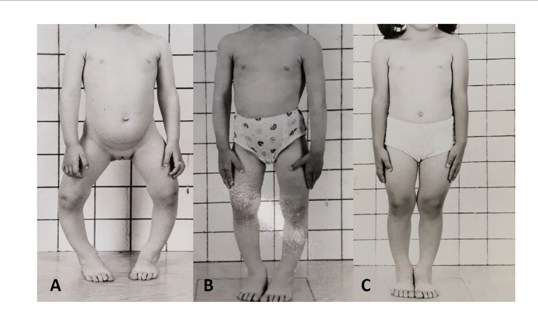
FIGURE 3 | Response to conventional medical treatment with phosphate and active vitamin D supplements in XLH. (A) Clinical presentation at age 3 years. (B) One year, (C) 2 years after initiation of conventional therapy.

costly, requires monitoring and may be associated with side effects such as gastrointestinal symptoms, arterial hypertension or nephrolithiasis/nephrocalcinosis. There is consensus however that insufficiency fractures or pseudofractures, planned surgical procedures are indications for medical therapy in adults, while treatment may be considered in case of raised (bone) ALP and/or bone pain (13).