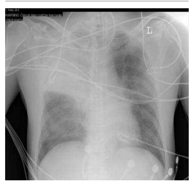
Postinstubation radiograph showing progression of the right-upper lobe opacity.

was 137 mmol/l, potassium 3.2 mmol/l, chloride 118 mmol/l, carbon dioxide 17.8 mmol/l, blood urea nitrogen 18 mg/dl, and creatinine 1.1 mg/dl, the latter representing an improvement. The glucose was 170 mg/dl, phosphate was down to 1.4 mg/dl, and albumin was 1.3 g/dl. The white cell count was 6500/mm³ with 15% bands; platelets were 56,000/mm³. The hematocrit was down to 28.4%. Cardiac enzymes were within normal limits. The arterial blood gases on 50% inspired fractional oxygen (Fio<sub>2</sub>) were as follows: pH 7.46, partial carbon dioxide tension (Pco<sub>2</sub>) 24 mmHg, and partial oxygen tension (Po<sub>2</sub>) 99 mmHg. Central venous pressure (CVP) was 14 cmH<sub>2</sub>O. Central venous Po<sub>2</sub> was 39 mmHg. Lactate was 5.6 mg/dl. Norepinephrine (noradrenaline) was being started (Fig. 3).