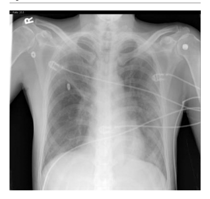
Radiograph showing generalized improvement.