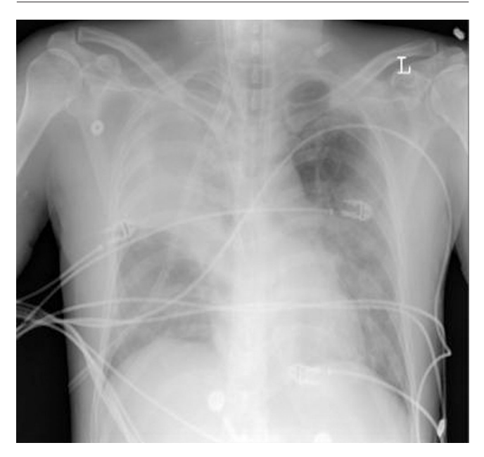
Radiograph showing progressive involvement of both lungs.

improvement. Regardless, many of these patients may go on to develop organ failure. A threshold is often reached at which volume is given to the point that the presumption is that the patient is intravascularly replete. How is that point defined in the patient with organ failure? It depends, in part, on the age of the patient and cardiac function. If the patient is young or left ventricular function is known from a previous echocardiogram, then a central venous line with CVP and central venous oxygenation (scVo<sub>2</sub>) monitoring may be adequate. Alternatively, if cardiac function is not known or there is a suspicion of compromise, especially in an elderly patient, or if a large volume of fluid has been given without improvement, then invasive monitoring with a pulmonary artery (PA) line would be a consideration. When do you decide that enough fluid has been given? When is it time to hang a pressor or an inotrope? Initial volume resuscitation should be between 8 and 10 l, but after that how do you decide if that is enough or if are they leaking into the third space?