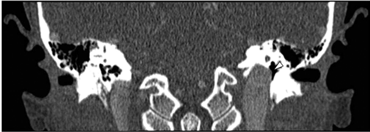
Fig. 1 – Coronal view of both middle ears by computed tomography in a patient with pulsatile tinnitus in the left ear. The asymmetry of both jugular bulbs can be observed at the level of the jugular foramen, with dominance and elevation of the left jugular bulb. Note the sigmoid plate dehiscence on the left side (white arrowhead), which conditions discrete protrusion of the left jugular bulb into the middle ear.