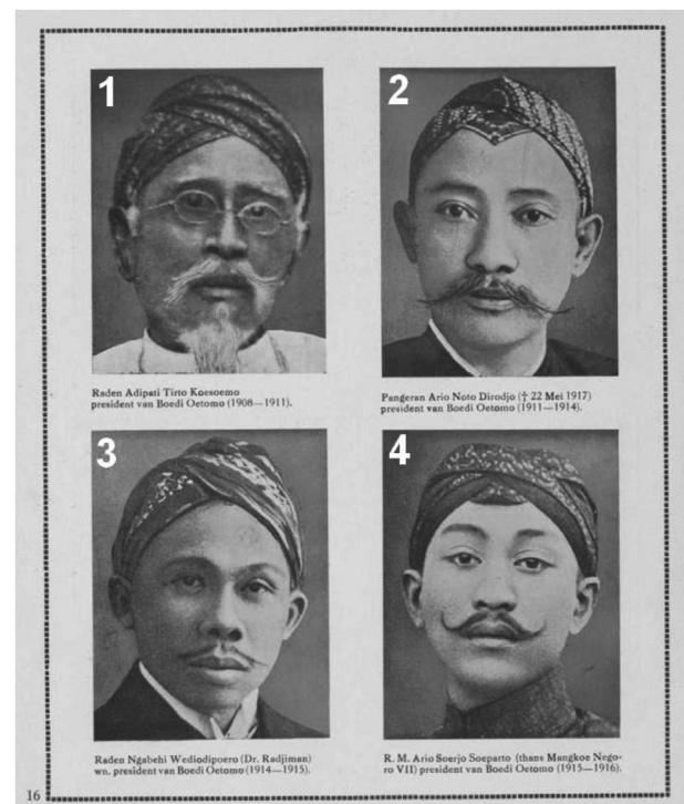
Figure 6. Figures of Boedi Oetomo in a ten-year memento book of Boedi Oetomo entitled Soembangsih Gedenboek Boedi Oetomo (1908–1918) .

Figure 6 shows an interesting point that four leaders of Boedi Oetomo were Freemasonry members, except for Number 4. Raden Adipati Tirta Koesoemo (Number 1) was the president of van Boedi Oetomo in 1908–1911 and was a Freemasonry member appointed at the Mataram lodge in 1895 (T. Stevens, 2004). Number 2 was Prince Ario Noto Dirodjo of the Pakualaman Palace who was the president of van Boedi Oetomo in 1911–1914, joined the Mataram lodge in 1887, and held various management positions in Freemasonry (T. Stevens, 2004). Prince Ario later became the chairman of Boedi Oetomo in 1911–1914. Number 3 was Raden Ngabehi Wediodipeoro (Dr. Radjiman), who was the president of van Boedi Oetomo in 1914–1915 and had been a Freemason since 1922 (T. Stevens, 2004; Van der Veur, 1976). Meanwhile, number 4 was R.M. Ario Soerjo Soeparto, who was later known as Mangkoe Negoro VII. He was the president of van Boedi Oetomo. He was not confirmed as a