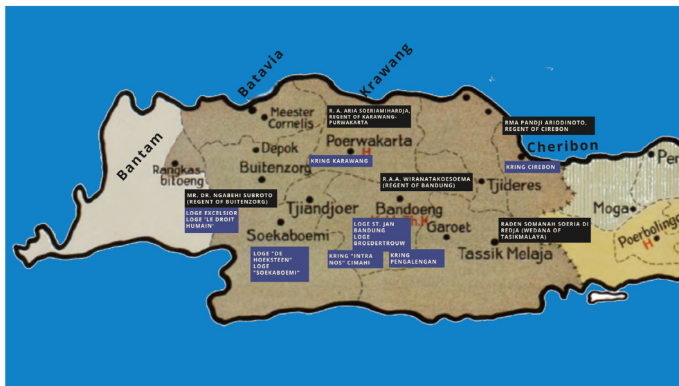
Figure 4. Names of lodges and kring of Priyayi Freemasons in several cities in Priangan (West Java).