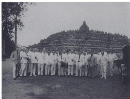
Figure 1. Members of the Mataram Loji travelling to Borobudur Temple in 1925.

An example of visiting an ancient Javanese non-Islamic site was Loji Mataram's activity to come to Borobudur Temple in 1925 as shown in Figure 1. One of the corridor walls of Borobudur shows the birth of Khrishna (the last incarnation of Vishnu) who was born from a representation of a virgin mother, from whom A Human-God will be born (Perelaer, 1888). This depiction gives the impression that the birth of