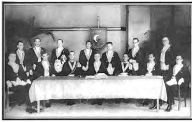
Figure 5. Celebration of Sint Jan Day at the Mataram lodge in 1934.

thoughts and ideology began to be influenced. This condition agreed with Snouck Hurgronje, who divided two opposing poles: priyayi-abangan (Javanese culture) and santri . Freemasonry's activities were directed to the hostility of the two-pole thinking.