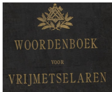
Figure 2. The hammer, square, and compass symbols in the front cover of A. S. Carpentier Alting's book entitled Woordenboek voor Vrijmetselaren (Source: A.S. Carpentier Alting, 1884, Woordenboek voor Vrijmetselaren , Haarlem: De Erven F. Born).

The Dutch's colonial practices in the archipelago were performed through indirect rules; thus, they did not change the previous paternalistic bureaucratic and administrative systems (Hasan, 2018). In contrast, Britain performed direct rules in colonization in Asia by placing and involving Europeans directly in its governance structures. The Dutch