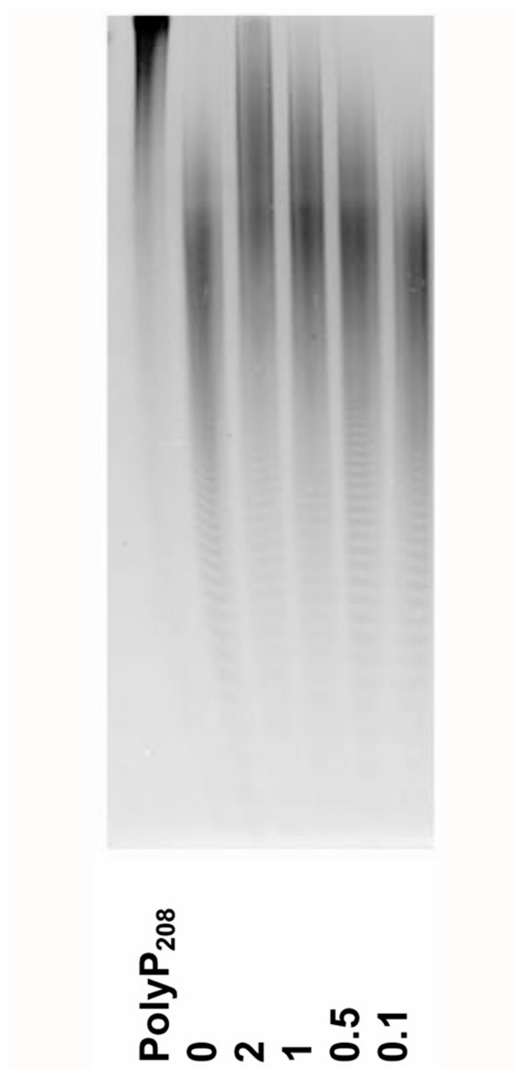
Fig 3. The effect of ATP on the endopolyphosphatase reaction of PPN1 in the presence of 0.25 mM MgSO 4 . PolyP PAGE was performed in 24% polyacrylamide gel with 7M urea; toluidine blue staining. PolyP 208 - PolyP 208 was incubated without the enzyme at 30°C for 60 min. The numerals indicate ATP concentrations (mM). The PAGE experiment was repeated in triple and the photograph of typical experiment is shown.