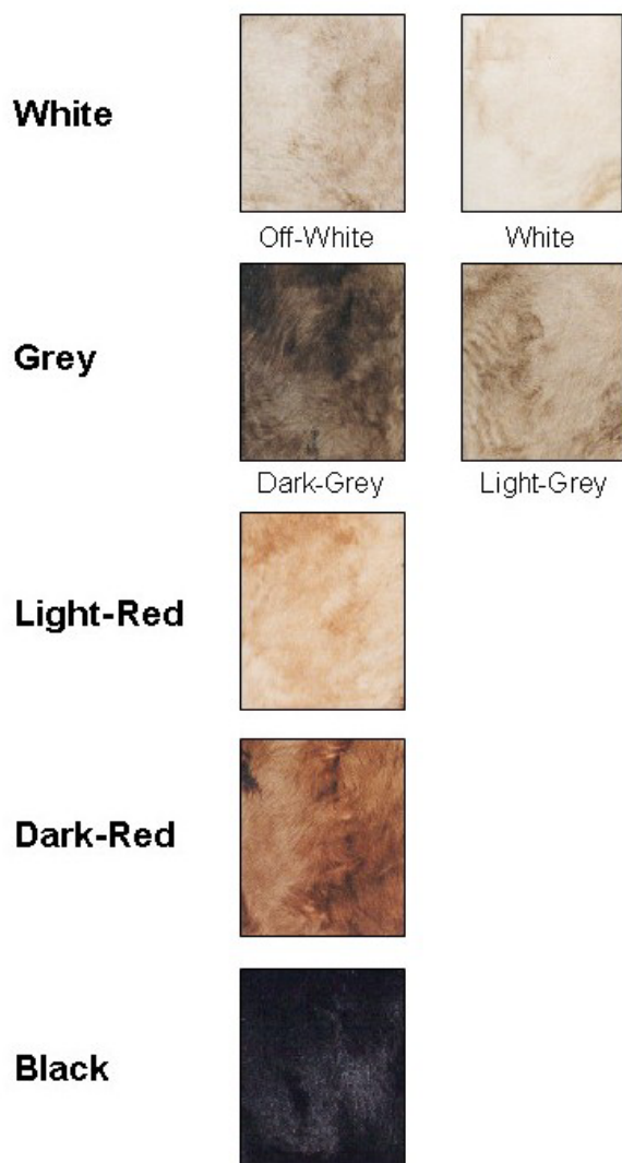
Figure 1 Coat colour categories used for visual scoring of the second-generation individuals of the F2-Backcross population studied. The primary analysis was based on the five category colour scoring (White, Grey, Light-Red, Dark-Red and Black). The initial visual scoring had considered seven subcategories (White, Off-White, Light-Grey, Dark-Grey, Light-Red, Dark-Red and Black).

model as a fixed effect, the genome-wide significant effects initially identified for the dilution-related traits on chromosome 5 were no longer significant.