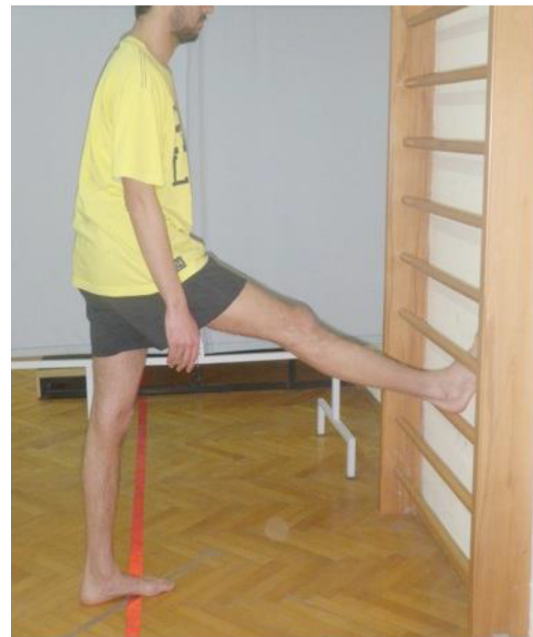
FIG. 1. Static stretching.

Subjects performed the hold-relax technique bilaterally as a self-stretch under the supervision of a physiotherapist. The technique consisted of an active SLR with dorsiflexed ankle and toes. The subject raised his legs by turning the heel towards the opposite shoulder while clasping the hands around the back of the thigh. Then the subject performed a hold contraction for 10 seconds and relaxed