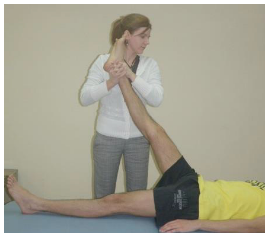
FIG. 3. Mulligan traction straight leg raise technique.