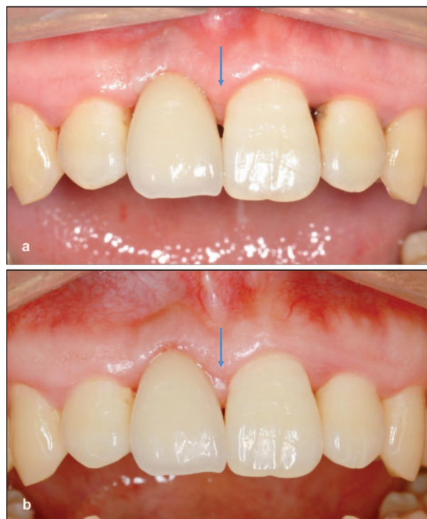
Figure 3 View of the implant-supported crown in the region of upper right incisor in group 2. The mesial papilla (blue array) variation: (a) baseline PFI scores: 1; (b) follow-up PFI score: 2. PFI, papilla fill index.