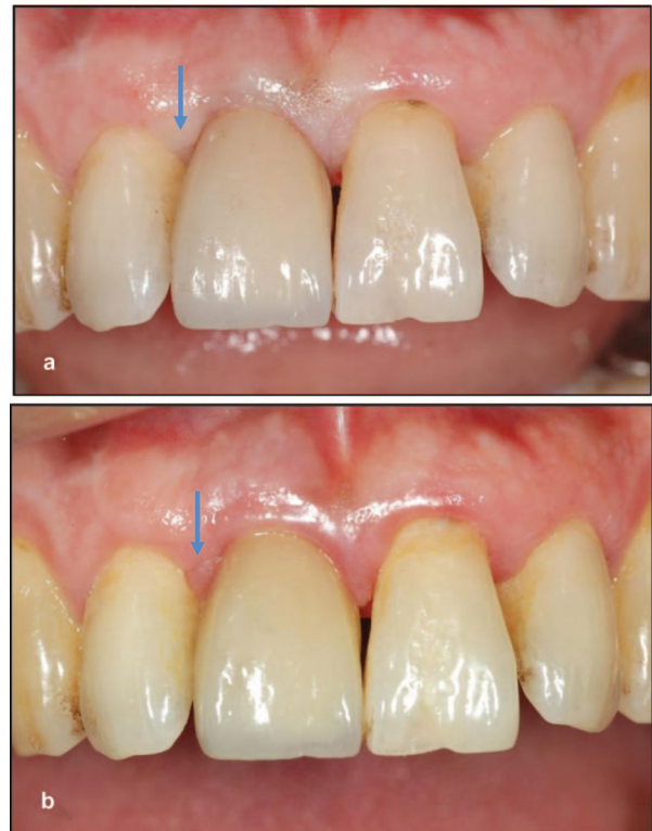
Figure 2 View of the implant-supported crown in the region of upper right central incisor in group 1. The distal papilla (blue array) variation: (a) baseline PFI scores: 1; (b) follow-up PFI score: 2. PFI, papilla fill index.

a Pearson and deviance Chi-square results showed high goodness-of-fit of the regression model (Pearson Chi-square: 0.699, P=0.705 ; residual deviance: 0.560, P=0.756 ).