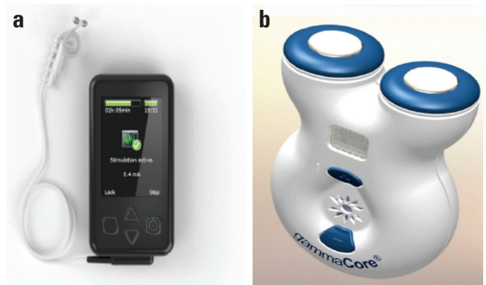
Figure 3. Non-implantable vagus nerve stimulation systems: (a) NEMOS® (transcutaneous vagus nerve stimulation; Cerbomed, Erlangen, Germany), (b) gammaCore (noninvasive vagus nerve stimulation; ElectroCore, Basking Ridge, NJ, USA)

As noted earlier, different levels of parasympathetic stimulation exert different anti-arrhythmic effects. Thus, it has been