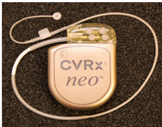
Figure 2. Carotid sinus nerve stimulation therapy system (Barostim neo™ System, CVRx Inc., Minneapolis, MN, USA)

Clinical evidence from the Autonomic Tone and Reflexes after Myocardial Infarction study (25) and the Cardiac Insufficiency Bisoprolol Study II (26) indicates that diminished cardiac vagal activity and increased heart rate predict a high mortality rate in congestive heart failure. Therefore, modulation of the ANS (neuromodulation) with the aim of restoring a more normal