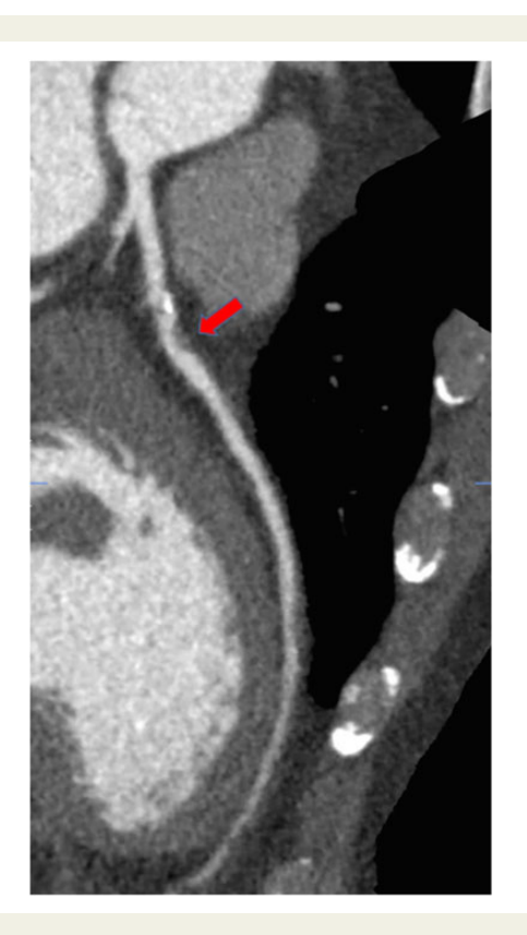
Figure I Computed tomography coronary angiography image of a plaque with high-risk characteristics including low attenuation (red arrow).

for CHD and high negative predictive value. The weakness of CTCA in overestimating or poorly defining obstructive disease due to calcification can be mitigated by considering the functional assessment afforded by the exercise ECG. Thus, combining a simple functional test with a highly sensitive anatomical test may represent an ideal strategy in the diagnosis and risk stratification of patients with suspected CHD.