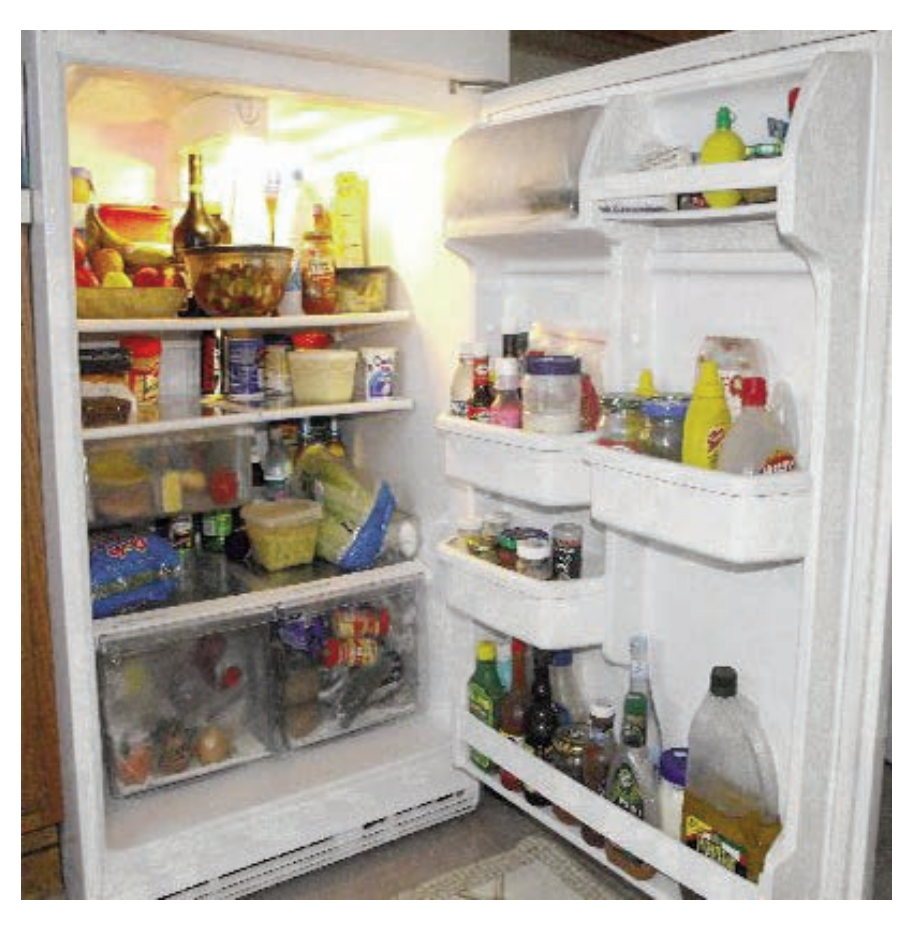
Figure 1. Question 7: What do you think about this refrigerator?

Eggs were mentioned by a number of respondents in different interviews in relation to storage: Why are eggs not in the fridge at the supermarket? , or In the shops you buy them on the shelf but I must put them in the fridge, do I really need too? Participants seemed to be confused by the different storage condition between shop and home.