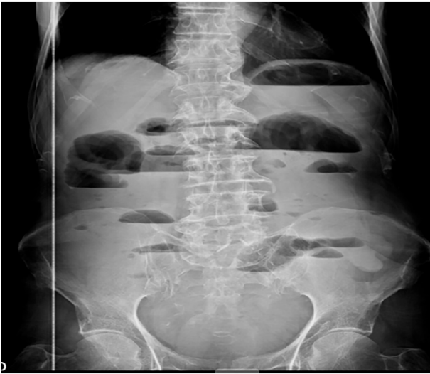
Fig. 1. Abdominal plain X-ray film: an ileus pattern with distended small bowel loops and multiple air-fluid levels.

of the entrapped bowel loop which was perforated (Fig. 3D). The band was ligated and divided, segmental resection carrying the perforated segment of the small bowel with manual grelogrelic anastomosis. The patient reported being satisfied with the intervention, and the post-operative course was uneventful. Pathologic analysis revealed necrosis in the segment resected. Since the operation, the patient has been asymptomatic.