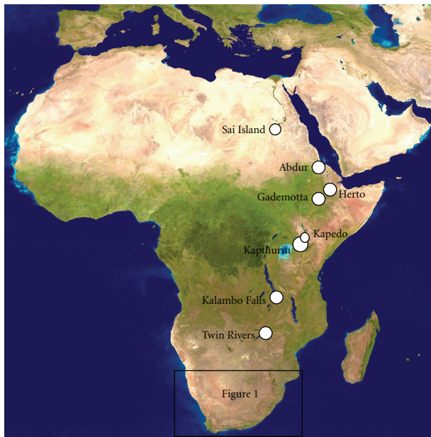
FIGURE 2: Location of the sites discussed in the text.

either Homo erectus or H. rhodesiensis . In contrast, the Florisbad hominin skull (the type specimen of Homo helmei [11]) is associated with a “Floridian Land Mammal Age” (see [8] FLMA; ~780–~10 ka) faunal assemblage and MSA technology and is dated to ~259 ka [12, 13]. The oldest FLMA assemblage comes from Gladysvale Cave at between 780 and 578 ka [14]. Currently, the earliest well-dated Homo sapiens remains come from Omo and Herto in Ethiopia between 198 and 147 ka [15, 16]. In southern Africa, the oldest modern human remains come from Border Cave, Klasies River Mouth, and Pinnacle Point and are all dated to less than 184 ka [17–20]. The Border Cave 1 and 2 remains could be