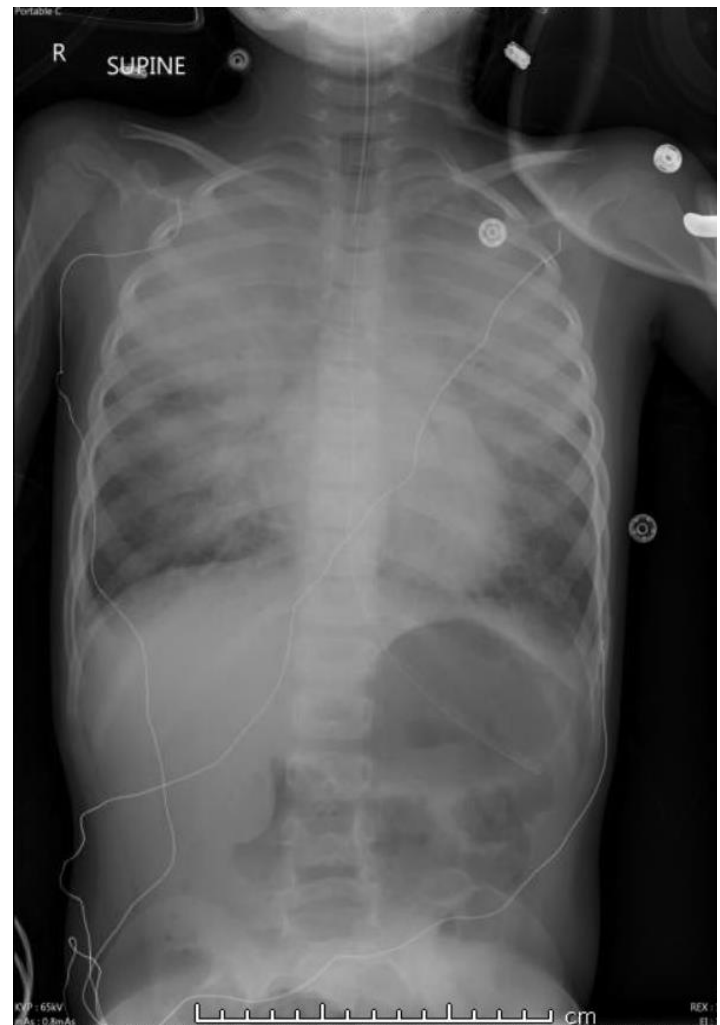
Image 3. Post-Intubation chest radiograph demonstrating worsening edema consistent with acute respiratory distress syndrome.

complaints, adolescents may complain of gastrointestinal symptoms including abdominal pain, nausea, and weight loss. 8 Symptomatic atrial dysrhythmias may be seen. 1