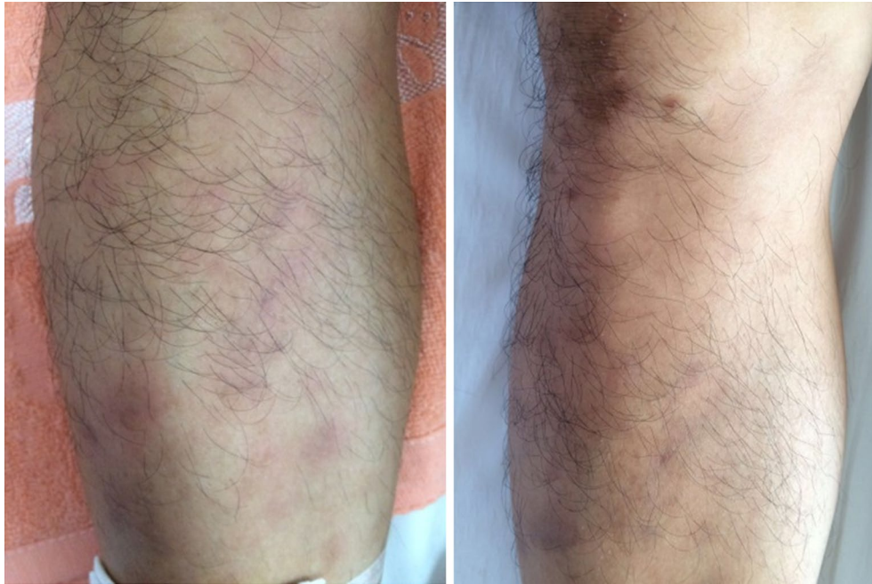
Fig. 1 The picture of red tubercular rashes on both lower limbs. Note: The patient has red tubercular rashes on both lower limbs, erythematous nodular rashes with diameter of about 3–10 mm and vague boundaries on his limbs