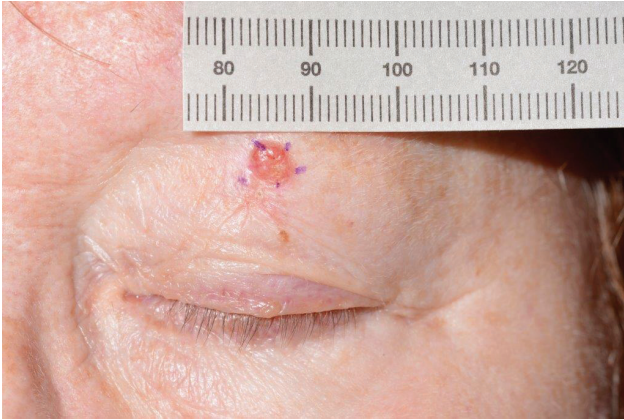
Fig. 1. Measurement of horizontal diameter of preoperative basal cell cancer using surgical ruler. Informed consent for publication of the clinical image was obtained from the patient.

of an ellipse. The post-Mohs defect were measured at the time of excision to respect the normal tone of the surrounding tissue, so that to reduce the overestimation of the defect.