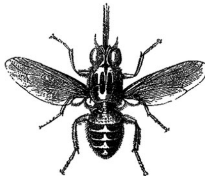
Tsetse Fly. —Magnified.—See p. 571.

FELLOW OF THE FACULTY OF PHYSICIANS AND SURGEONS, GLASGOW; CORRESPONDING MEMBER OF THE GEOGRAPHICAL AND STATISTICAL SOCIETY OF NEW YORK; GOLD MEDALLIST AND CORRESPONDING MEMBER OF THE ROYAL GEOGRAPHICAL SOCIETIES OF LONDON AND PARIS, F.S.A., ETC., ETC.