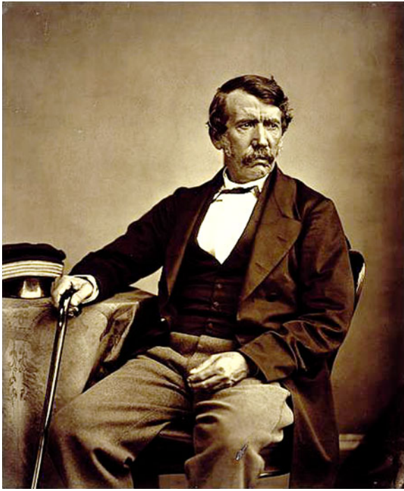
Fig. 1. David Livingstone, photographed by Thomas Annan in 1864. Used by kind permission of Flickr The Commons.