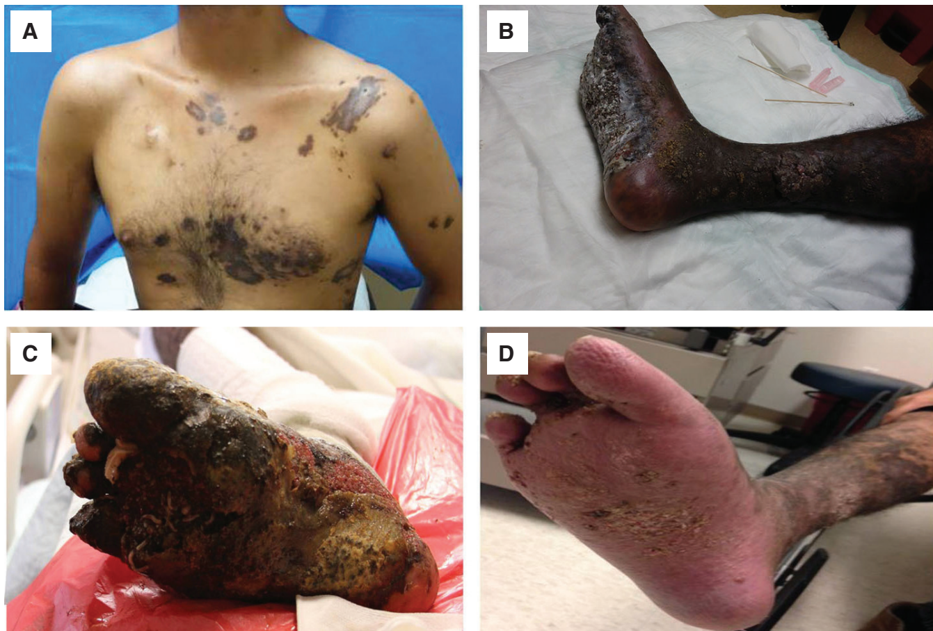
Figure 3 – Skin lesions after the first dose of chemotherapy and (A, B) before, (C) during, or (D) 1 year after maggot debridement therapy.

the physical action of the maggot over the wound). 14 Maggots exclusively feed on (debride) only the dead (necrotic or gangrenous) tissue, hence leaving the viable tissue intact, which is a definite advantage over conventional surgical debridement. Besides, other beneficial effects on the wounds like microbial killing (disinfection) and hastened wound healing (growth stimulation) were also observed and have been confirmed by numerous clinical and laboratory studies. 15