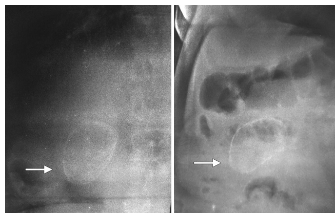
Fig. 1: Plain X-ray abdomen showing calcified gall bladder

A 55-year-old female presented with complaints of intermittent pain in right upper abdomen of 15 days duration. There was no history of any fever, jaundice, and vomiting. Abdominal examination was unremarkable. Ultrasound abdomen revealed a large calcified mass in gallbladder fossa with normal common bile duct and normal liver echotexture. After corroboration with X-ray abdomen (Fig. 1), the provisional diagnosis of porcelain gallbladder was made. Contrast-enhanced computed tomography (CECT) abdomen confirmed the diagnosis of porcelain gallbladder with no evidence of malignant change (Fig. 2). Liver function test was normal. Patient was planned for open cholecystectomy. Intraoperatively, it was a difficult dissection as gallbladder was completely calcified, brittle, and densely adhered to liver bed. After dissecting Calot's triangle and dividing cystic duct and artery, gallbladder was excised and sent