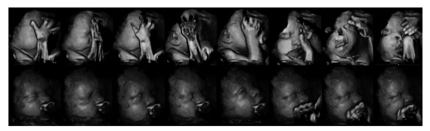
Figure 1 Illustrative 4D scan frames of a 32-week-old foetus of a smoking mother (top line) and a 32-week-old foetus of a nonsmoking mother (bottom line) over a 10-second period of observation.

where C_{it} are the event counts for foetus i at gestational age t, \lambda_{it} is the underlying Poisson rate, \beta_0 to \beta_7 are unknown