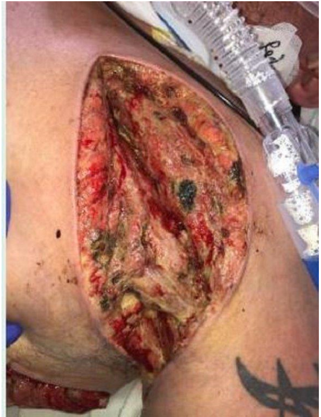
FIGURE 2: Left axilla wound

On exam, there was still a significant amount of nonviable tissue in the base of the left chest and axilla wound. The left chest wound measured 8 x 19 x 8 cm and the left axilla wound measured 6.5 x 25 x 4 cm. NPWTi-d with ROCF-CC was applied to these wounds to aid in the removal of the nonviable tissue. Figures 2-4 show the presentation of the wounds prior to the application of the NPWTi-d with ROCF-CC.