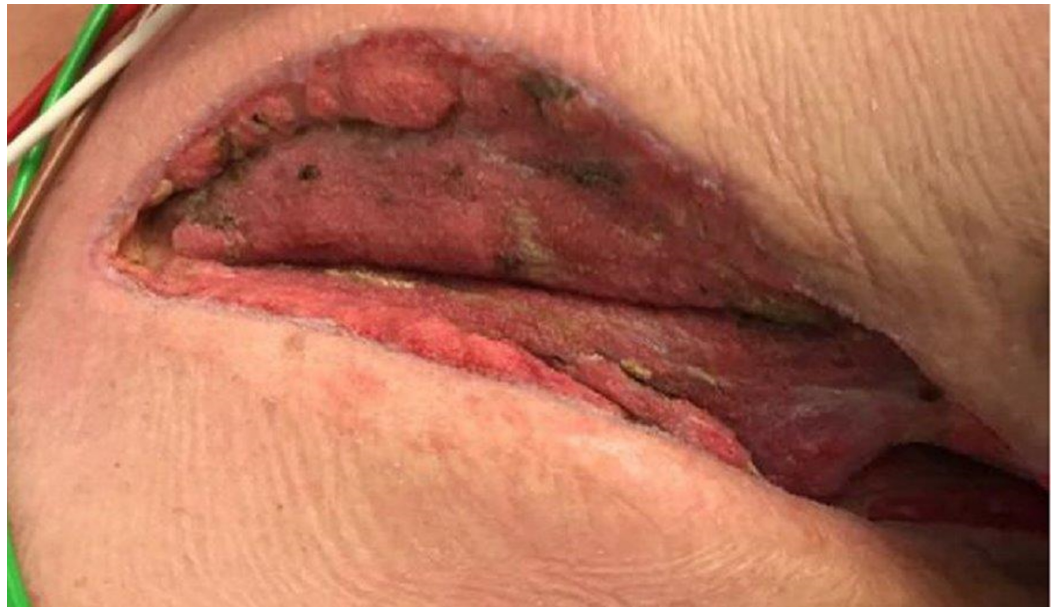
FIGURE 9: Standard NPWT initiated to left axilla wound