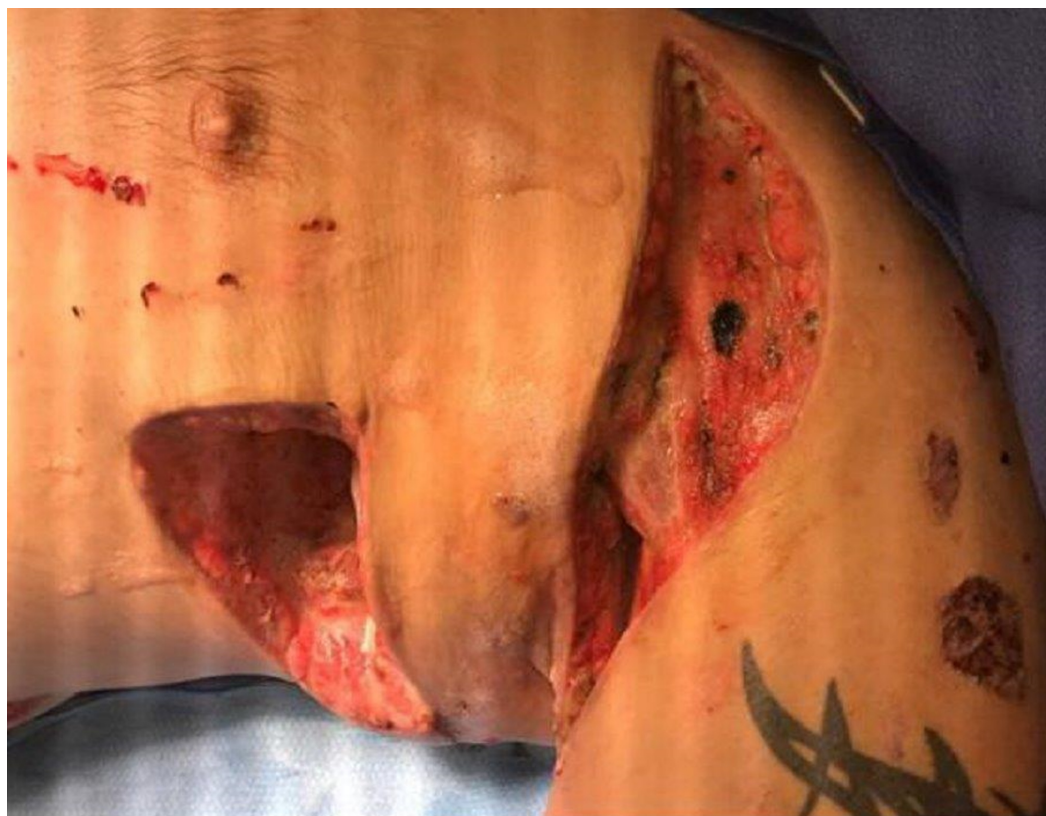
FIGURE 8: Granular tissue noted in both wound bases

For the next two weeks the treatment regimen utilizing NPWTi-d to the wounds continued. The dressings were changed three times a week at the bedside by the WOCN. During initial assessment, the axilla wound measured in total volume 650 \text{ cm}^3 and the chest wound measured 1,216 \text{ cm}^3 . After 17 days utilizing the combination of NPWTi-d with and without ROCF-CC, the axilla wound measured in total volume 342.25 \text{ cm}^3 and the chest wound measured 554.4 \text{ cm}^3 . This presents a significant decrease in overall measurements. At this time, NPWTi-d was discontinued and standard NPWT with black granufoam was utilized to both wounds at -125 \text{ mmHg} (Figures 9-10).