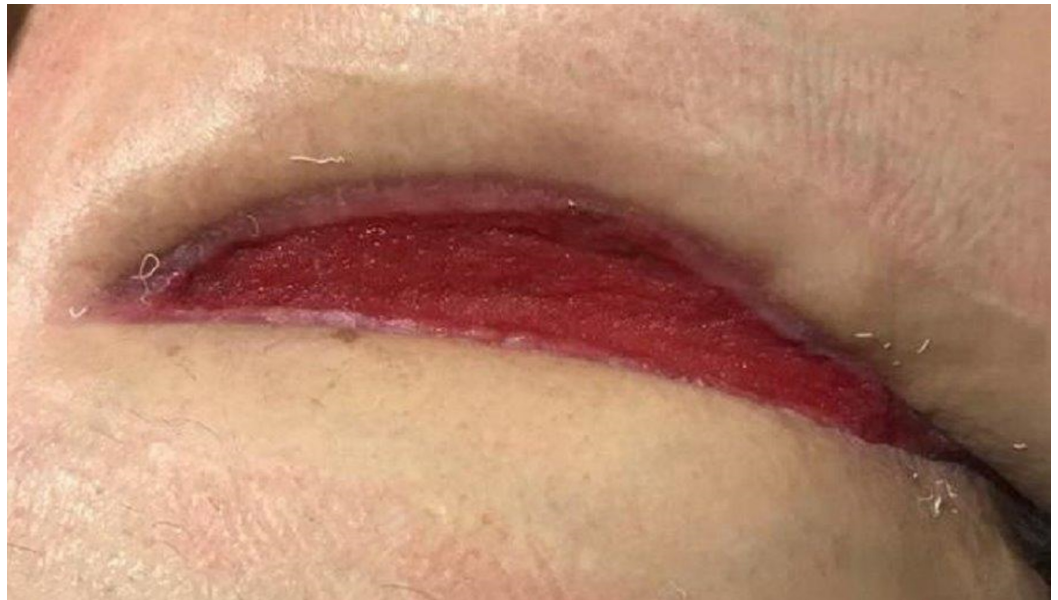
FIGURE 11: NPWT was discontinued and an antimicrobial alginate dressing was utilized in the left axillary wound