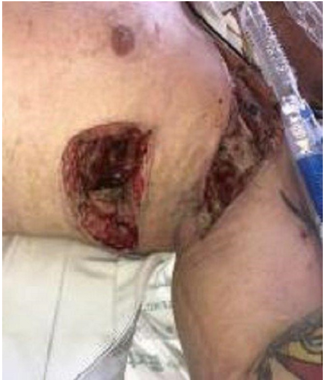
FIGURE 3: Both axilla and chest wounds