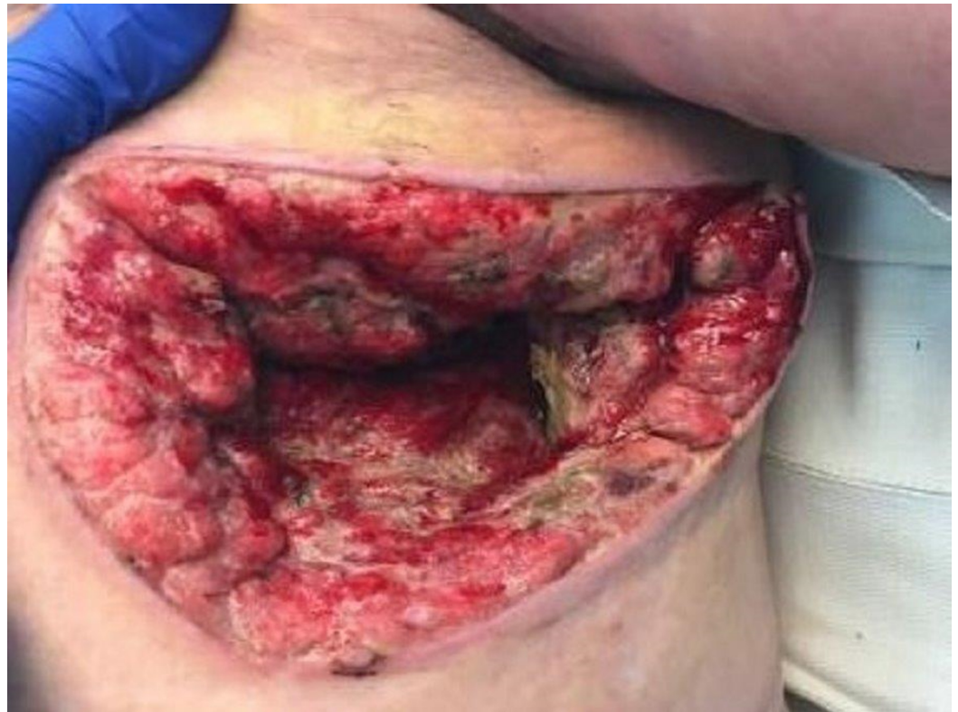
FIGURE 4: Left chest wound

During the application of the NPWTi-d with ROCF-CC, care was taken to ensure that the contact layer of the dressing was in contact with the entire wound base. Barrier rings were applied to the skin creases along with any area that presented as a high risk for inadequate seal of the drape (Figure 5). The therapy settings for the left axilla were 85 ml of hypochlorous acid solution (Vashe®, SteadMed, Fort Worth, TX), dwell time of 10 minutes with NPWT every hour at -125 mmHg. Therapy settings for the left chest wound were 50 ml of hypochlorous acid solution, dwell time of 10 minutes with NPWT every hour at -125 mmHg.