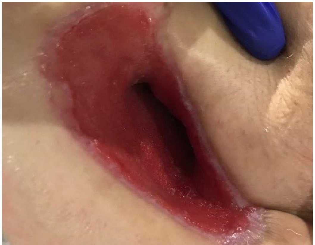
FIGURE 12: NPWT discontinued and an antimicrobial alginate dressing was utilized for the left chest wound