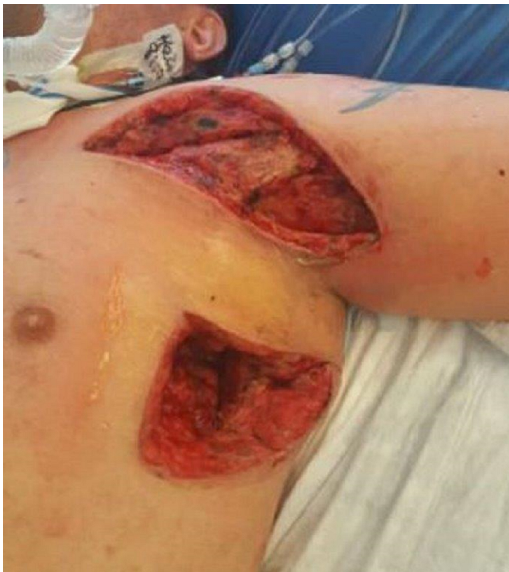
FIGURE 6: First dressing change after application of NPWTi-d with ROCF-CC

NPWTi-d with ROCF-CC was reapplied to the axilla wound ensuring that the contact layer was placed deep into the wound bed to facilitate the removal of the seropurulent drainage. The left chest wound was transitioned to NPWTi-d to continue to promote granulation tissue (Figure 7). The instillation solution was switched to normal saline due to blockage alarms we encountered with the hypochlorous acid solution without resolution.