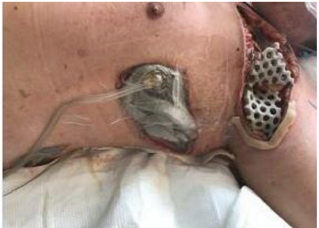
FIGURE 5: Application of NPWTi-d with ROCF-CC

During the first dressing change after the application of the NPWTi-d with ROCF-CC, there were notable improvements in the quality of the tissue in the wound bed (Figure 6). The left chest wound bed was noted to have 100% red healthy tissue and the left axilla wound bed had a decrease in nonviable tissue. There was, however, seropurulent drainage noted deep within the intramuscular structures of the left axilla wound.