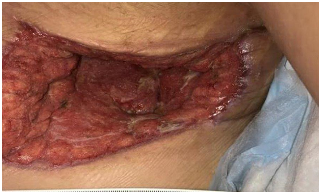
FIGURE 10: Standard NPWT initiated to left chest wound

NPWT was utilized for approximately a month to promote granulation tissue and assist with wound contraction (Figures 11-12). Once the wound had made vast improvements, NPWT was discontinued and a non-adherent antimicrobial alginate dressing (Silvercel™ Non-adherent, Acelity, San Antonio, TX) was lightly packed into the wound bed and covered with a dry sterile dressing. This dressing was then changed three times a week by a visiting nurse association. The wound measurements prior to discharge showed significant improvement in comparison to the wound measurement at presentation, with the left axilla wound measuring 1.5 x 10.5 x 0.3 cm and the left chest wound measuring 3.5 x 9 x 5 cm.