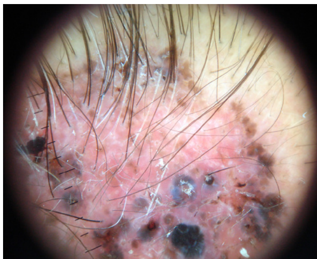
Figures 2, 3. Dermatoscopy: blue-gray globules, leaf-like structures and structureless areas.