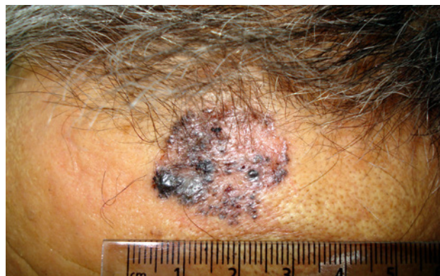
Figure 1. Pigmented lesion on forehead.

A 48-year-old man presented with a two-year-history of a slowly growing pigmented lesion on his forehead. Dermatological examination revealed an irregular, multi-colored papule with a diameter of 25 x 26 mm (Figure 1). Dermatoscopic examination disclosed blue-gray globules, leaf-like structures and structureless areas (Figures 2, 3).