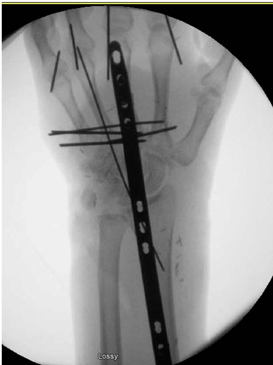
FIGURE 2: X-ray showing stabilization of the metacarpal fractures with K-wires and a spanning wrist plate placed to stabilize the wrist.