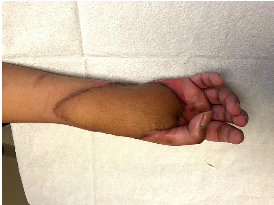
FIGURE 5: A follow-up picture showing a well-healed and contoured flap.

The patient recovered uneventfully and subsequently underwent secondary procedures for plate removal and flap thinning and flexor tendon reconstruction (Figure 5).