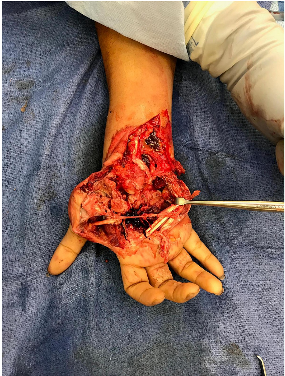
FIGURE 1: Hand defect showing the extent of the injury and devascularization.

nerves. A dorsal vein from the right foot was used as an interposition vein graft to reconstruct the superficial palmar arch. All the common digital and proper digital arteries were anastomosed end to side to the vein graft in order to revascularize the digits. We applied Integra® as a temporary cover over the vein graft and soft tissue defect (Figure 3).