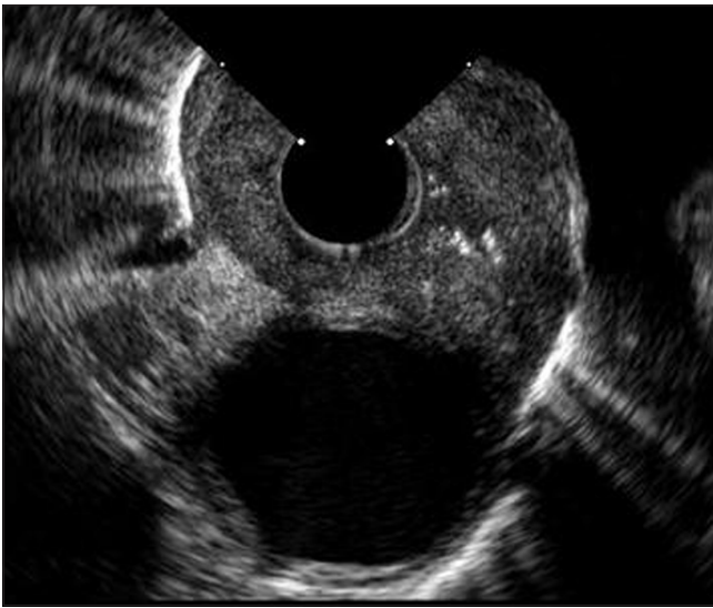
Fig 4. T4 lesion T4 lesion, with mass seen to invade aortic wall (hypoechoic aorta seen at 6 o'clock, normal five layered oesophageal wall replaced by mass)