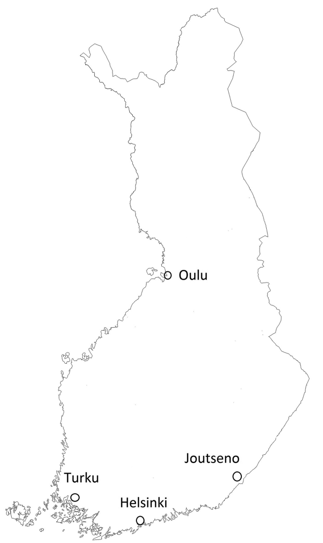
Figure 2 Permanent study locations in transit reception centres.

birth, nationality, mother tongue and desired language of the interpreter services.