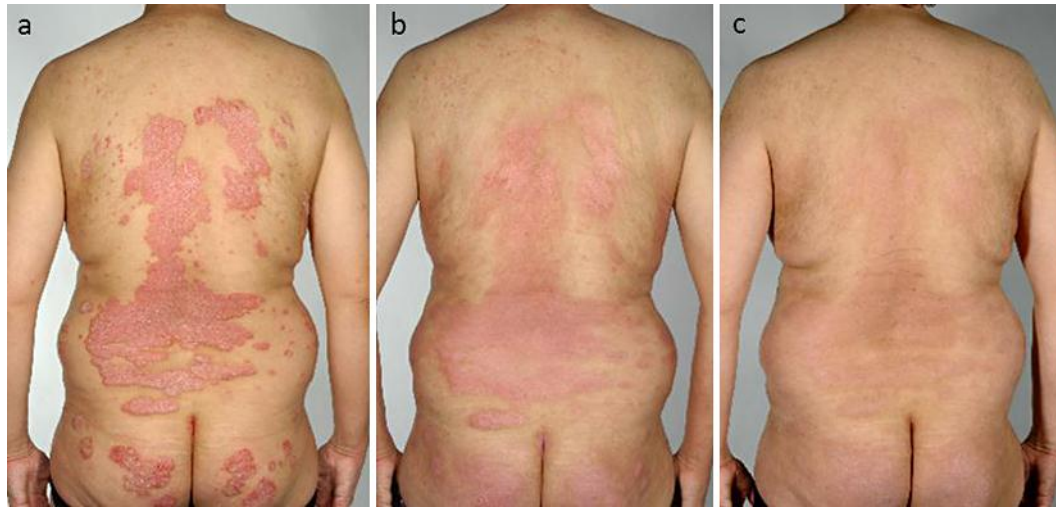
Fig. 1. Marked improvement of psoriasis during treatment with adalimumab. a Before treatment. b After 3 months. c After 8 months.

Yayli et al.: Adalimumab in Recalcitrant Severe Psoriasis Associated with Atopic Dermatitis