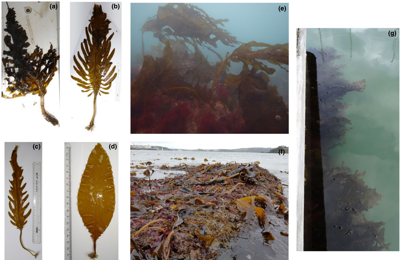
FIGURE 1 Different developmental stages of Undaria pinnatifida sporophytes (a–d). Undaria pinnatifida can be found growing in the subtidal and intertidal, as well as on natural and artificial substrates (e–g)