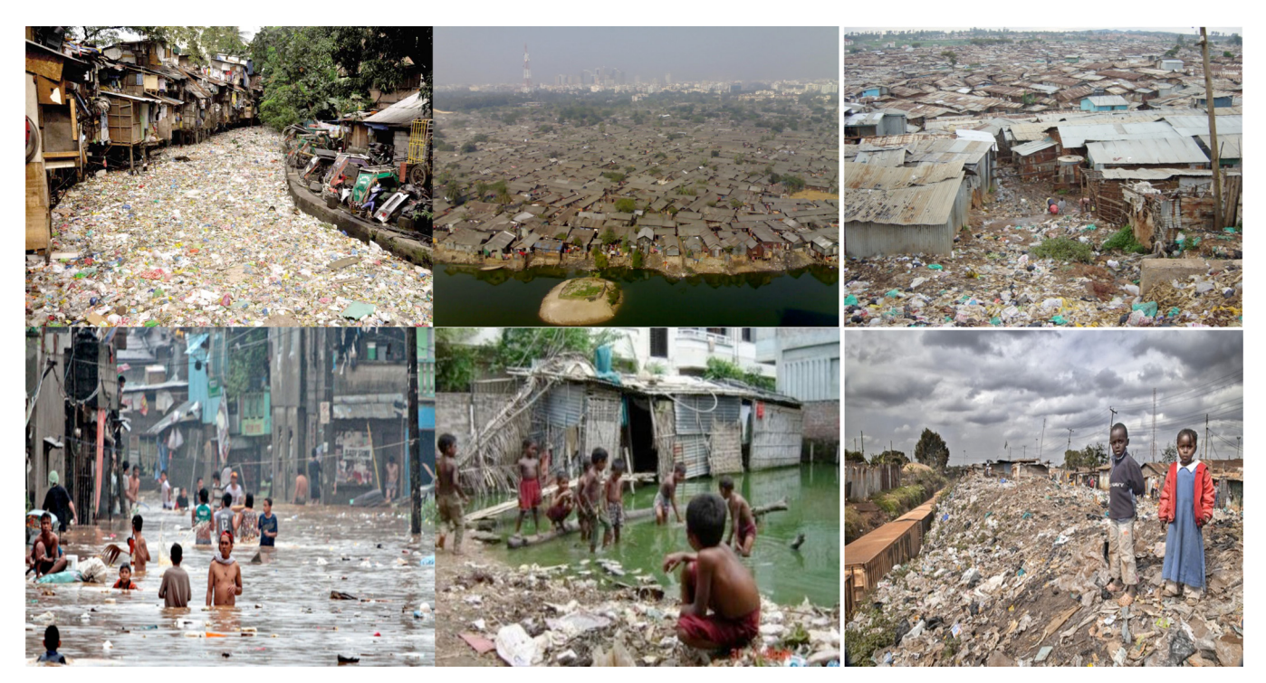
Figure 1. The breeding grounds for the next global pandemic: left panel illustrates slums in Metro-Manila, The Philippines; the middle panel shows slums in Dhaka, Bangladesh, and the right panel displays slums in Kibera, Kenya. Note photographs are available on public domain.

human/host/reservoir interaction.<sup>10</sup> Weak malnourished populations in LMICs serve as the breeding grounds for future pandemics (Figure 1). For example, in metro Manila, the most densely populated city in the world, approximately six million people live in slums with no piped water or toilets. According to WHO, 137 million people in urban centres have no access to safe drinking water and over 600 million lack sanitation.<sup>10</sup> The UN predicts that the world's urban population will double to over six billion by 2050 and most of the increase in density will occur in LMICs.<sup>10</sup> Population density is directly correlated with the rate of transmission of respiratory and faecal-oral pathogens (e.g. Mycobacterium tuberculosis, influenza, cholera, rotavirus, helminths).<sup>10</sup>