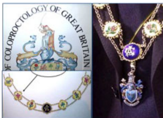
Figure 4 The presidential chain of office showing the national emblems taken from the coat of arms

The second ceremonial marker, worn by every President since 2002, was the gold-enamelled presidential badge, struck in Sheffield in 1994, and a chain of office (Figure 4), commissioned later in Birmingham and costing around £4000 (about £8000 in today’s prices). The badge features the coat of arms. The chain has sequential national emblems of England, Scotland, Wales and Ireland. These national emblems were symbolically important for the ACPGBI. Whilst both developments might now be considered anachronistic, the coat of arms currently remains the internationally recognisable symbol of the ACPGBI.