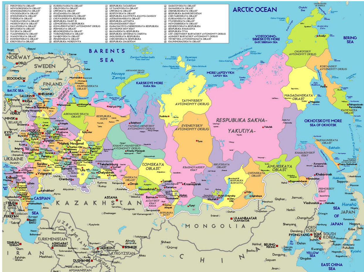
Fig. 1. Administrative division of Russia.

Automatic system was launched recently, and it is now developing; its quality is not good enough yet. Data on food, water, soil, air sample analyses (as well as cases of infectious and parasitic diseases) in all regions of the Russian Federation during the last years are accumulating in the system with the aim of further monitoring. This registry was formed on the basis of Federal Center of Hygiene and Epidemiology of Rospotrebnadzor – Federal Service of Oversight on Protection of the Rights of Consumers and Human Well-Being (formerly the Sanitary-Epidemiological Surveillance Service); the registry has a restricted Website (special permission is needed to get access). Data are presented in an Excel format without systematization; its content has no description in documents or reports.