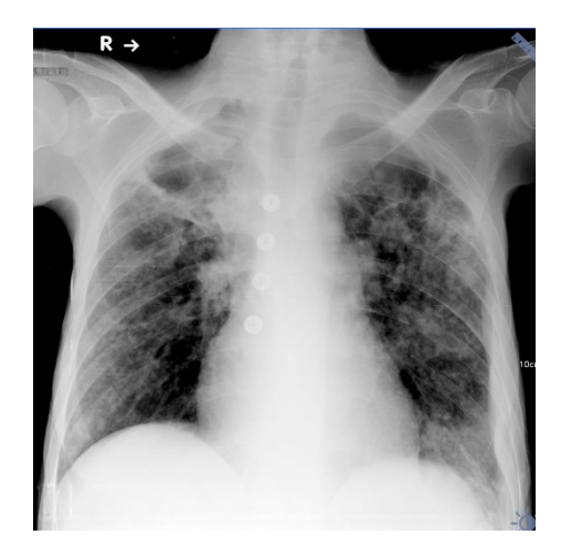
Figure 2. Chest X-ray anteroposterior in a horizontal position. Extensive, parenchymal consolidations in both lungs with low-attenuation areas in upper zones suggest cavitations.

The chest radiograph showed extensive, parenchymal consolidations in both lungs, with low-attenuation areas in upper zones suggesting cavitations (Figure 2).